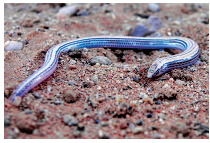
FIGURE 11. Adult Bogert's Speckled Western Burrowing Skink Typhla-contias punctatissimus bogerti Laurent, 1964, from Pico Azevedo.

COMMENTS. — Haacke (1997) reviewed the taxonomic and nomenclatural history of Typhlacontias punctatissimus and its subspecies and recognized two sympatric subspecies in southern Angola — T. punctatissimus punctatissimus Bocage, 1873, and the Angolan endemic T. punctatissimus bogerti Laurent, 1964. In all of our speci-