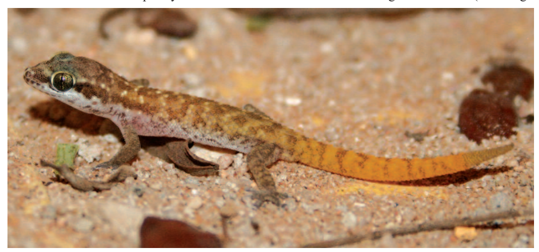
FIGURE 7. Juvenile Angolan Thick-toed Gecko, Pachydactylus angolensis (Loveridge, 1944), from Chimalavera, Benguela Province, Angola.

COMMENTS.— This poorly known taxon was described from Benguela Province (Loveridge