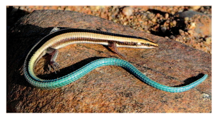
FIGURE 16. Adult Dwarf Plated Lizard, Cordylosaurus subtessellatus (Smith, 1844), from near Espinheira. Photo by Edward Stanley.

COMMENTS.— The species is known from the coastal areas of Benguela Province (Bocage 1867, 1895; Boulenger 1887) and from the Curoca River in Namibe Province (Bocage 1895). This specimen represents the southernmost record for Angola. The specimen was found hiding