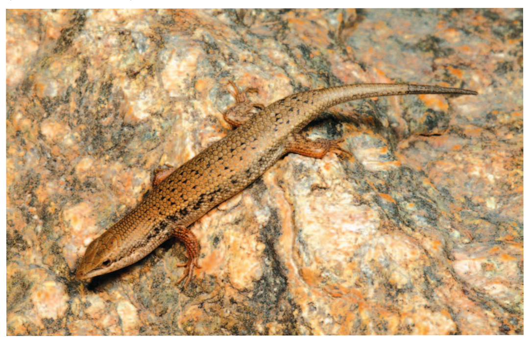
FIGURE 12. Adult Speckled Sand Skink, Trachylepis punctulata (Bocage, 1872), from Kamanjab, Kunene Region, Namibia.

region near the mouth of Curoca River, from the vicinity of Tombwa (formerly Porto Alexandre). Our specimens were collected among plants between dunes along the coast south of Tombwa, and these agree morphologically with the original description for the species. A comparison with the type material was impossible due to its destruction in the fire that destroyed the Lisbon Museum in 1978. Several uncatalogued specimens in the Museu Nacional de História Natural do Porto collected in 1905 by the Portuguese explorer Francisco Newton are congruent with the specimens collected by us. Newton's specimens are still in their original jar and are labeled "Mossamedes" (presumably refering to the province as a whole, not the city of Mossamedes = Namibe). They are part of a collection of vertebrates that the explorer made in the region. The herpetological specimens were only partly studied and published upon (Ferreira 1904, 1906; Ceríaco et al. 2014), in contrast to the bird and mammals collections (Seabra 1906a, 1906b, 1906c, 1906d, 1907). It is probable that these specimens are from Tombwa, as this was the main place where Newton collected while in the province (see bird records – Seabra 1906a). This is a common species in much of Namibia, Botswana, and central South Africa, as well as portions of Zambia, Zimbabwe, and Mozambique (Portik and Bauer 2012).