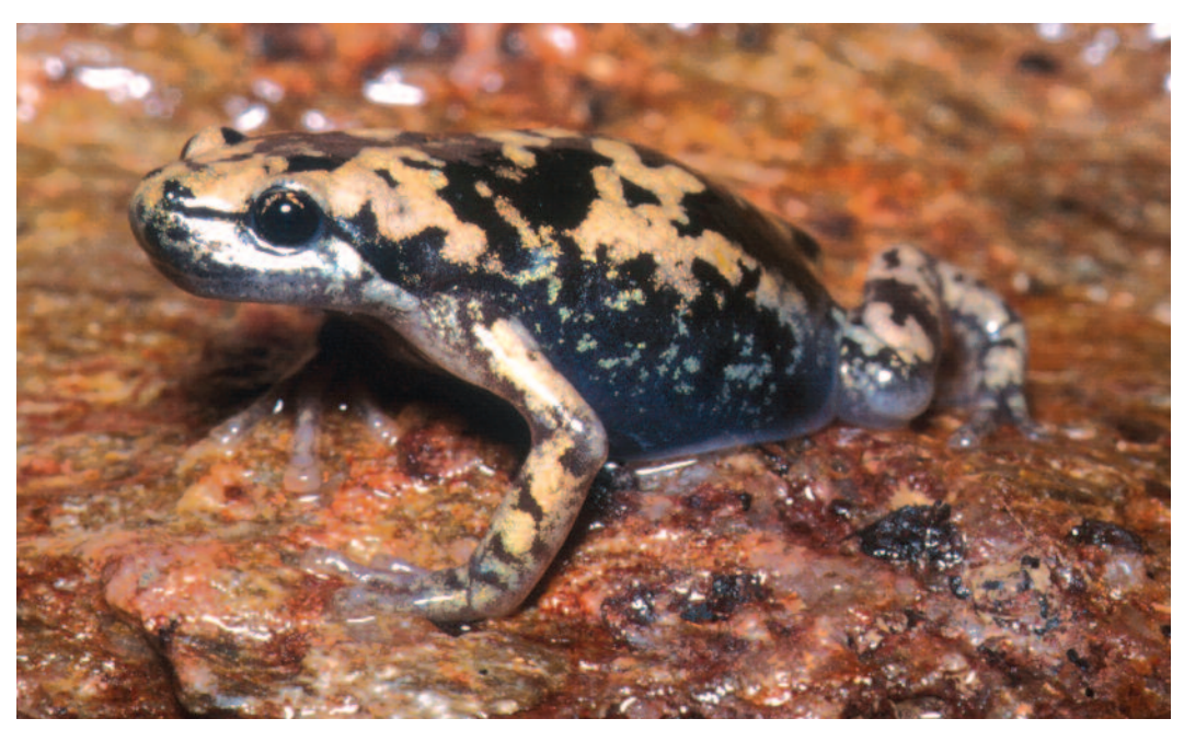
Figure 2. Marbled Rubber Frog, Phrynomantis annectens Werner, 1910, from Palmwag, Kunene Region, Namibia.