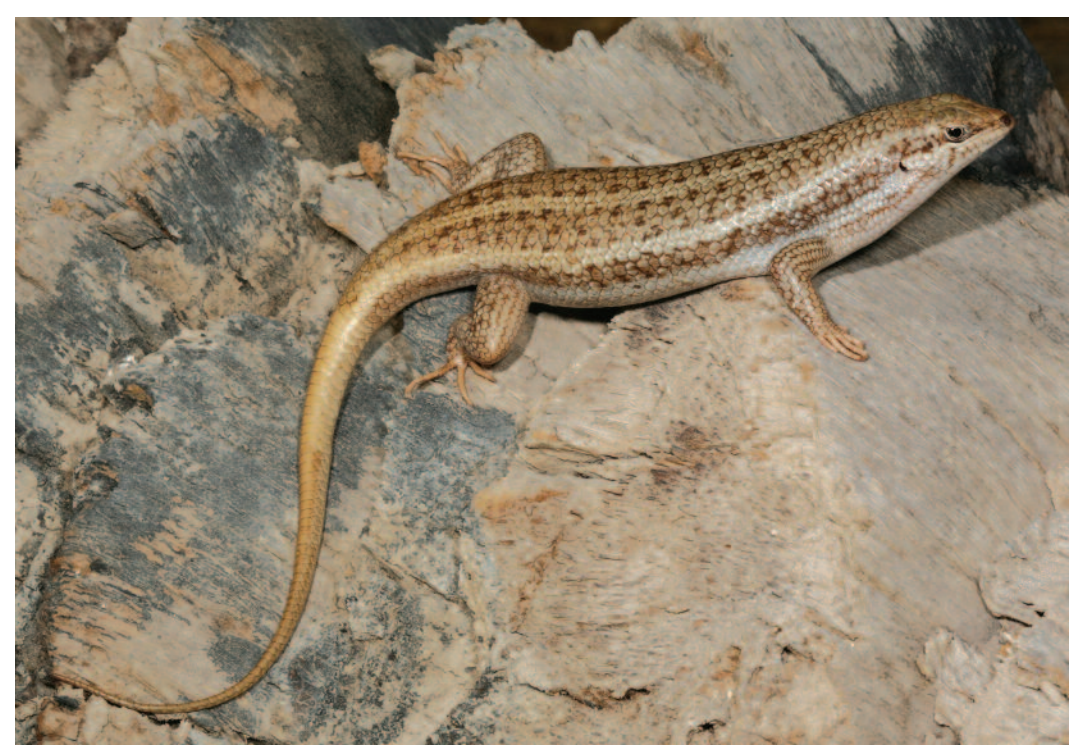
FIGURE 13. Adult Hoesch's Skink, Trachylepis hoeschi (Mertens, 1954), from Kamanjab, Kunene Region, Namibia.

from Iona National Park. The Angolan records extend the core distribution of its range in north-western Namibia (Branch 1998).