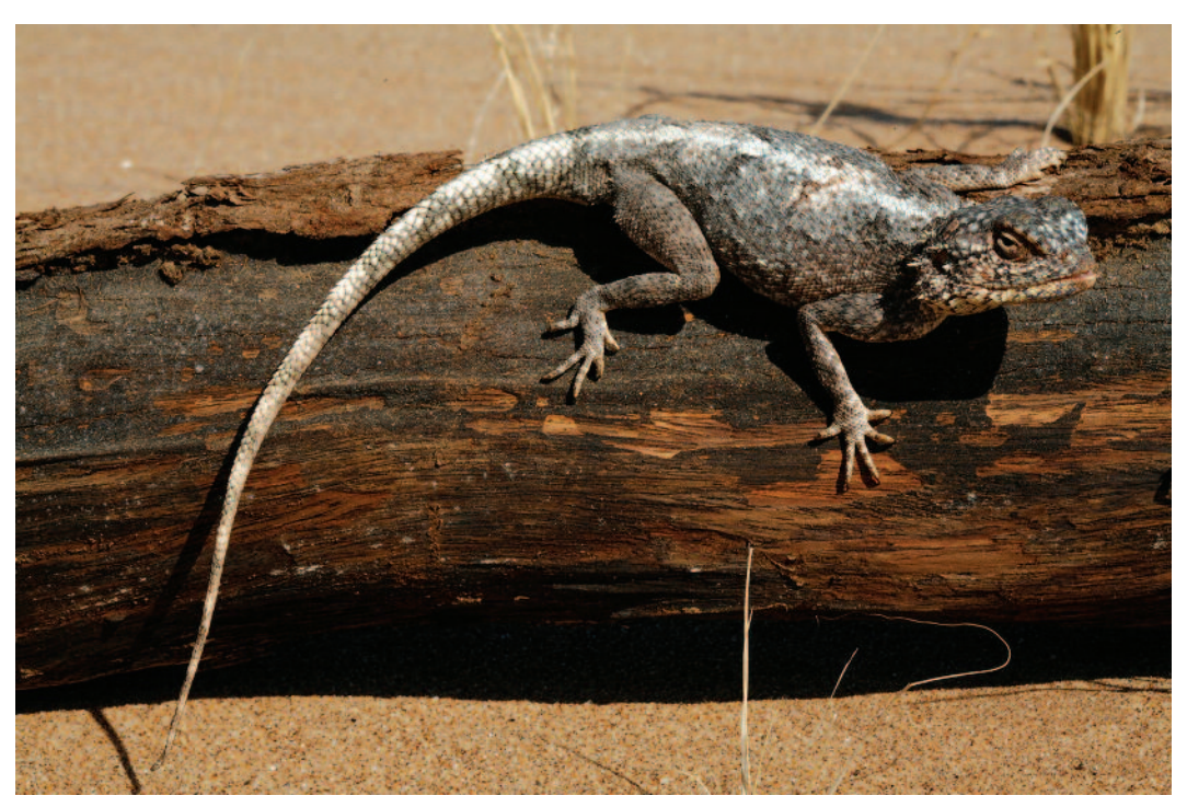
FIGURE 3. Anchieta's Ground Agama, Agama anchietae Bocage, 1866, from Sesfontein, Kunene Region, Namibia.