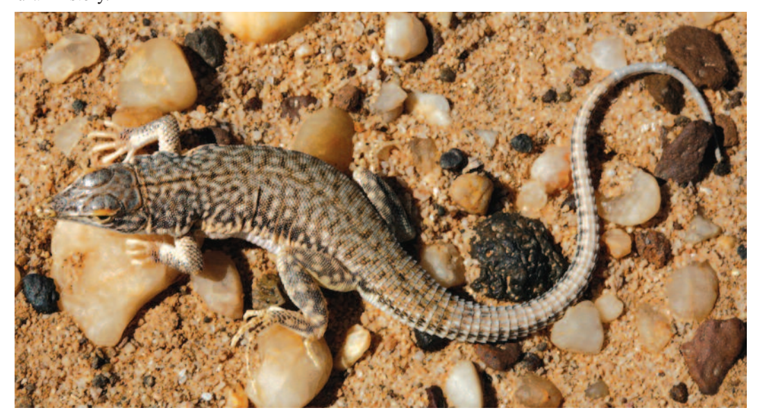
FIGURE 15. Adult specimen of Anchieta's Shovel-snout Lizard, Meroles anchietae , (Bocage, 1867) from gravel plains north of Henties Bay, Erongo Region, Namibia.

COMMENTS.— Bocage (1867) described this species from "Mossamedes." Bocage (1895) subsequently clarified that the types had come from the littoral zone at Rio Coroca [= Rio Curoca, southern Namibe Province, Angola]. The range of this species extends towards Namibia to the area of Conception Bay on the central coast. Although it is well documented within its Namibian range, this specimen is only the third published locality for Angola. The species is, however, well represented from numerous localities in Namibe by specimens in the Ditsong National Museum of Natural History.