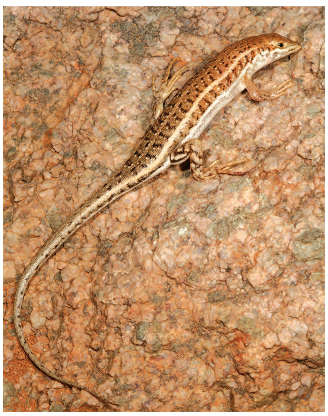
FIGURE 14. Adult Wedged-Snouted Skink, Trachylepis acutilabris (Peters, 1862), from Kamanjab, Kunene Region, Namibia.