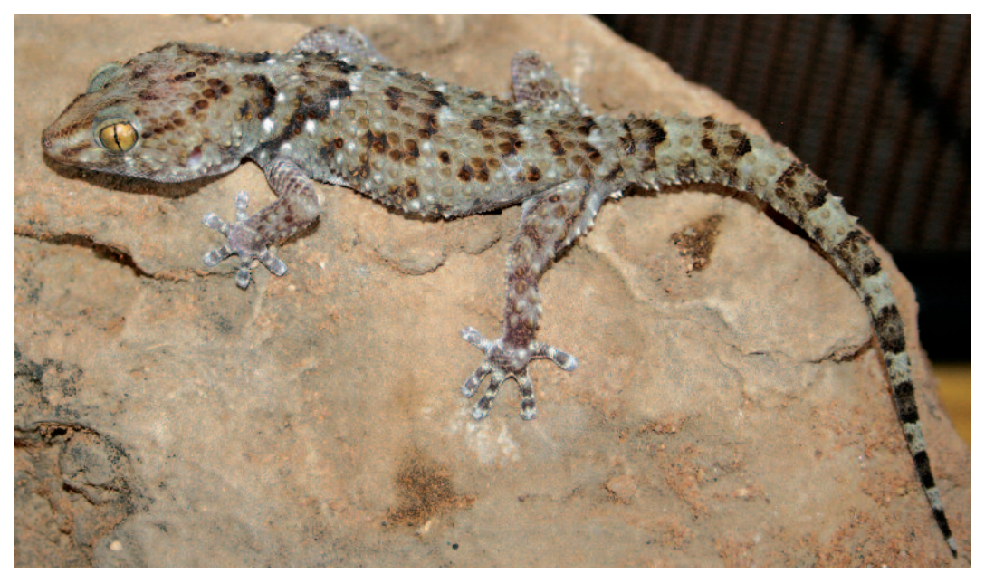
FIGURE 6. Subdult male Pulitzer's Thick-toed Gecko, Chondrodactylus pulitzerae . (Schmidt, 1933), from Chimalavera, Benguela Province, Angola.