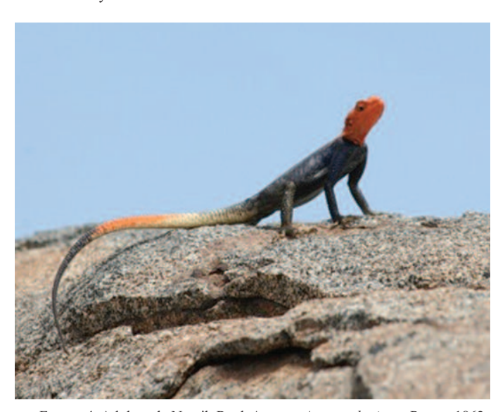
FIGURE 4. Adult male Namib Rock Agama, Agama planiceps Peters, 1862, from Pico Azevedo.

16°48'45.0"S, 12°20'22.9"E, 463 m (CAS 254753); Omauha Lodge camp, 2 December 2013, 16°11′55.4″S, 12°24′0.3″E, 335 m (CAS 254832); INP, north of Tambor, 4 December 2013, 15°59′46.0″S, 12°24′24″E, 307 m (CAS 254839); INP, south side of Curoca River crossing, 29 November 2013, 16°18′15.6″S, 12°25′1.56″E, 209 m (CAS 254845), 1 December 2013, 16°18′14.8″S, 12°24′2159.8″E, 210 m (CAS 254848); Pediva Hot Springs, 2 December 2013, 16°7′19.7″S, 12°33′40.0″E, 244 m (CAS 254859); Namibe-Lubango road, road marker 59, 1.8 km west by road from Caraculo, north side of the road,