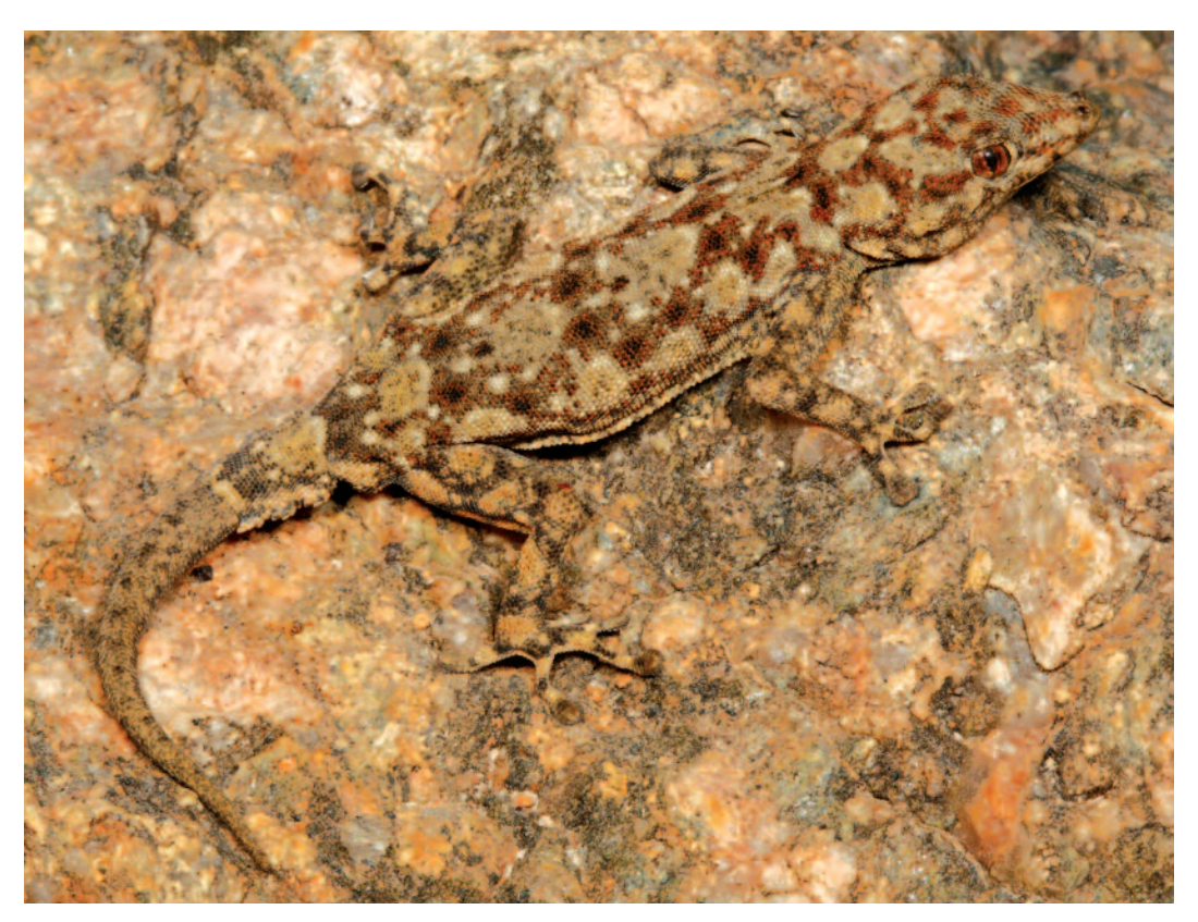
FIGURE 8. Adult Barnard's Namib Day Gecko, Rhoptropus barnardi Hewitt, 1926, from Kamanjab, Kunene Region, Namibia.

16°17′0.93″S, 12°33′39.81″E, 247 m (CAS 254852), 16°17′14.3″S, 12°33′35.9″E, 238 m (CAS 254856), 16°17′24.01″S, 12°33′43.9″E, 270 m (CAS 254863), Namibe-Lubango road, 2 km east (by road) of Mangueiras, south side of the road, 5 December 2013, 15°2′40.8″S, 13°9′32.6″E, 664 m (CAS 254890); NNP, 28 November 2013, 15°46′23.4″S, 12°19′58.9″E, 264 m (CAS 254954).