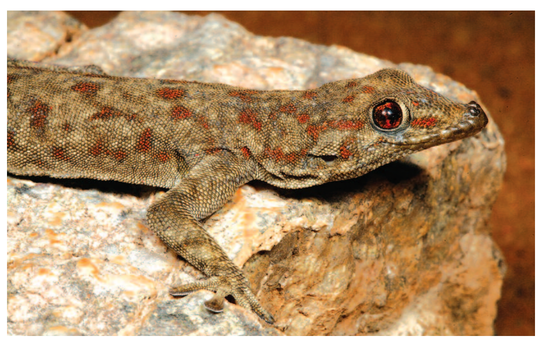
FIGURE 10. Adult Boulton's Namibe Day Gecko, Rhoptropus boultoni boultoni Schmidt, 1933, from east of Kamanjab, Kunene Region, Namibia.

16°12′1.2″S, 12°24′0.1″E, 343 m (CAS 254834); INP, Rio Curoca crossing, south side of river, 1 December 2013, 16°18′14.7″S, 12°25′0.0″E, 210 m (CAS 254849–254850), 2nd December 2013, 16°17′19.7″S, 12°33′40.0″E, 244 m (CAS 254857–254858, CAS 254861–254862), 29 November 2013, 16°18′15.6″S, 12°25′1.56″E, 209 m (CAS 254865); Leba Pass, between river and highway, 5 December 2013, 15°4′13.2″S, 13°14′37.7″E, 1676 m (CAS 254880); Namibe-Lubango road, 2.0 km east (by road) of Mangueiras, south side of the road, 5 December 2013, 15°2′40.8″S, 13°9′32.6″E, 664 m (CAS 254892), 15°2′40.7″S, 13°9′31″E, 640 m (CAS 254894, 15°0′55.1″S, 12°38′32.8″E, 497 m (CAS 254902); Namibe-Lubango road, road marker 59, 1.8 km west by road of Caraculo, 6 December 2013, 15°00′55.1″S, 12°38′32.8″E, 497 m (CAS 254903); Pico Azevedo, 7 December 2013, 15°32′2.4″S, 12°29′31.1″E, 359 m (CAS 254921–254926), 15°32′5.8″S. 12°29′29.5″E, 366 m (CAS 254946–254947, CAS 254949–254950); Espinheira, 29 November 2013, 16°47′20.2″S, 12°21′27.9″E, 457 m (CAS 254958).