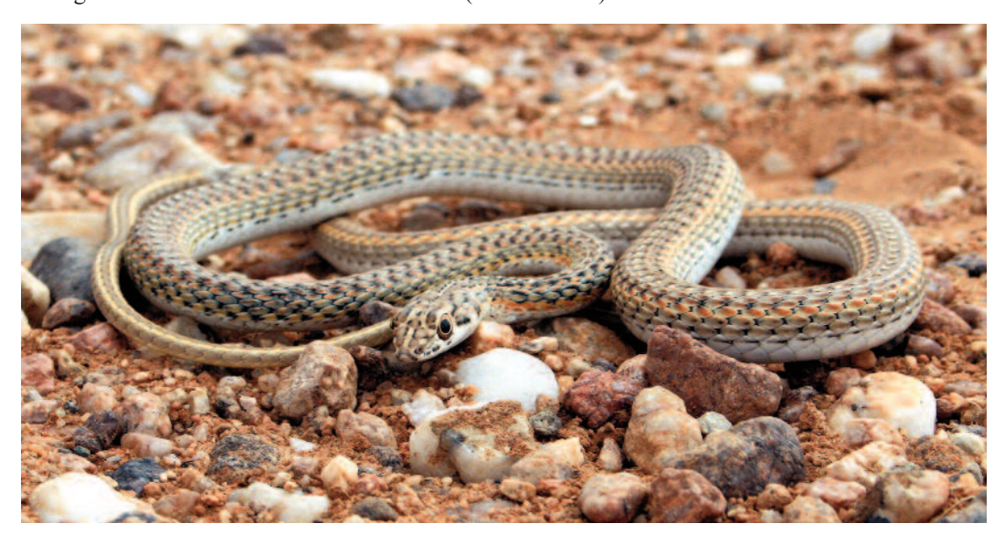
FIGURE 19 - Adult Karoo Sand Snake, Psammophis notostictus Peters, 1867, from Espinheira.

Comments.— Psammophis notostictus is easily recognizable from all other southern African Psammophis by its single cloacal shield and the presence of two preoculars (Broadley 1975b, 1977, 2002). These two specimens have both of these diagnostic characters. The species is known for Angola, but only from Namibe Province. The closest published records of the species are in Rio São Nicolau (Loveridge 1940; Broadley 1975b, 2002), Moçamedes [Namibe city] (Bocage 1887; Loveridge 1940), and Curoca River (Loveridge 1940; Broadley 2002). Our records expand the known distribution of the species further south in the country, although it is continuous southwards throughout much of western southern Africa (Branch 1998).