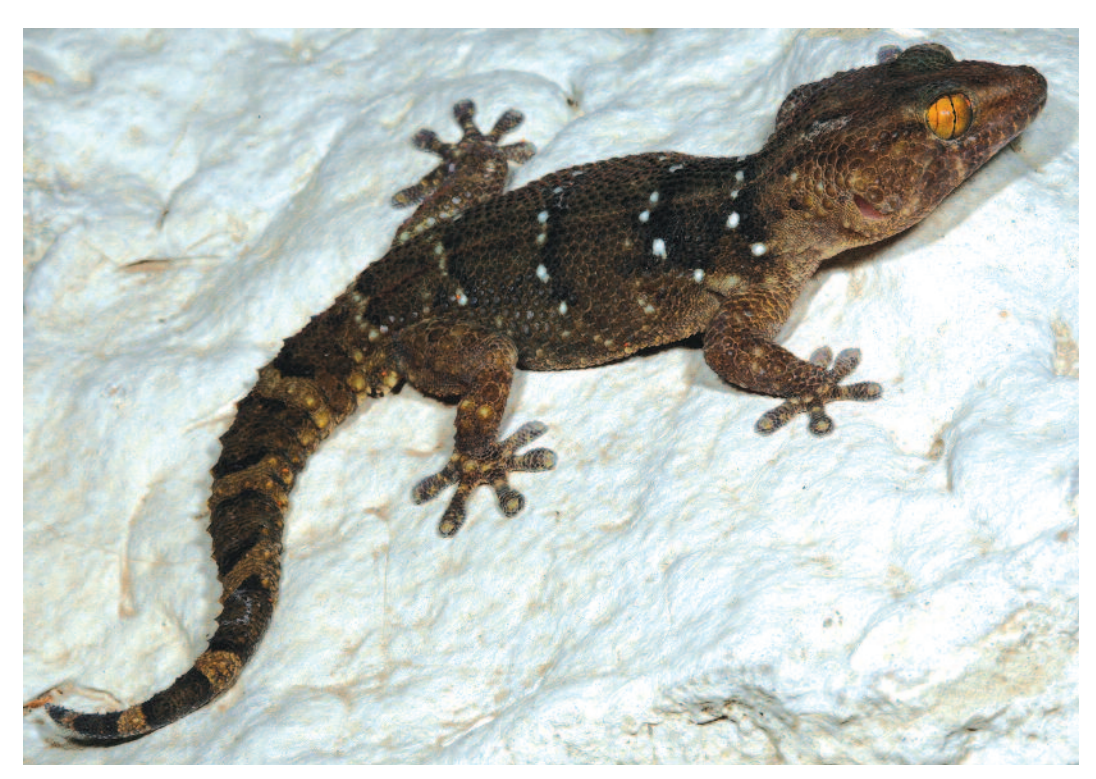
FIGURE 5. Adult male FitzSimons'Thick-toed Gecko, Chondrodactylus fitzsimonsi (Loveridge, 1947), from northern Kaokoveld, Kunene Region, Namibia.