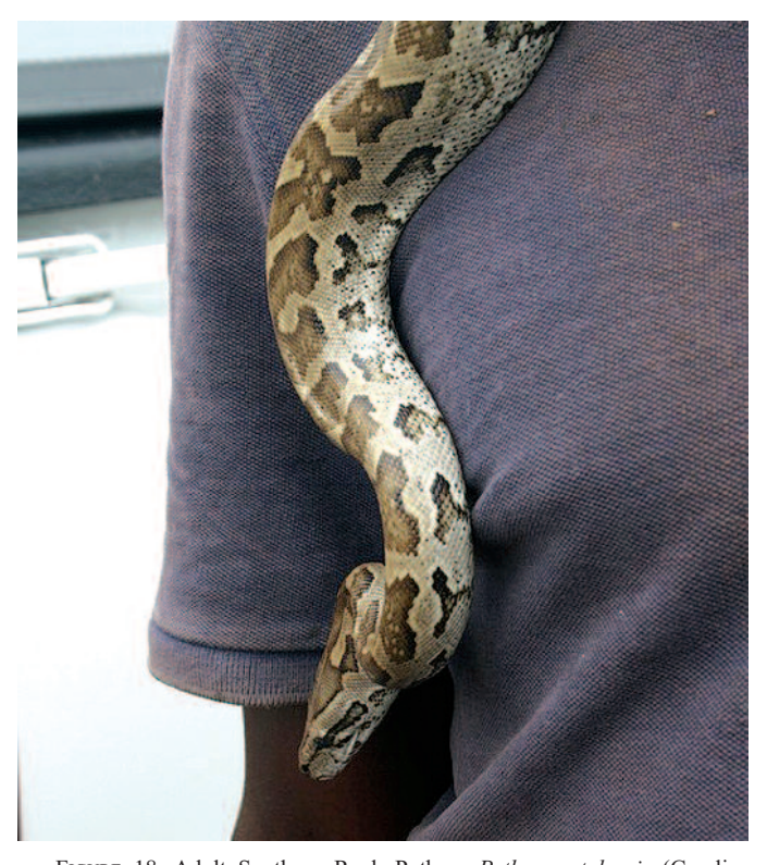
FIGURE 18. Adult Southern Rock Python, Python natalensis (Gmelin, 1788), being sold by a local near Bruco village.

COMMENTS.— A local at a site near Bruco village was selling a single live individual of Python natalensis, presumably collected nearby. In the province, this species is known from Maconjo (Bocage 1895; Broadley 1984) and from Giraul River (Bocage 1896; Broadley 1984). Python natalensis was for many years considered as a subspecies of Python sebae (Gmelin, 1789) (Broadley 1984), but was elevated to specific status by Broadley (1999) based on morphological differences as well the evidence of the overlapping distributions (Broadley and Cotterill 2004). Although the current taxonomic arrangement appears