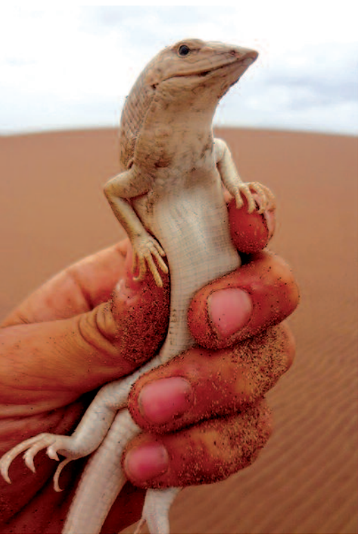
FIGURE 17. Adult female Desert Plated Lizard, Ger-rhosaurus skoogi Andersson, 1916, from the coastal dunes, near Praia do Navio.

COMMENTS.— This species was encountered basking at the sun in the coastal dunes SSW of Namibe, especially in dune valleys areas. When approached, these lizards dive into the sand, disappearing rapidly. The species is easily identified by its unique morphology and peculiar ecology. Sand trails resulting from the specimens walking in the dunes were noted. A total of five specimens were collected, three of which are at CAS and two at INBAC. Several additional animals were observed in the area but not collected. Males have a distinct black throat and venter, and are considerably larger than the females. The only published Angolan records are from the type locality, Porto Alexandre, between Mossamedes and the mouth of the Cunene River (Andersson 1916; Fitzsimons 1953), approximately in the same area as our material. Although the species is the most distinctive of all Gerrhosaurus (Nance 2007), it is unambiguously nested among more typical