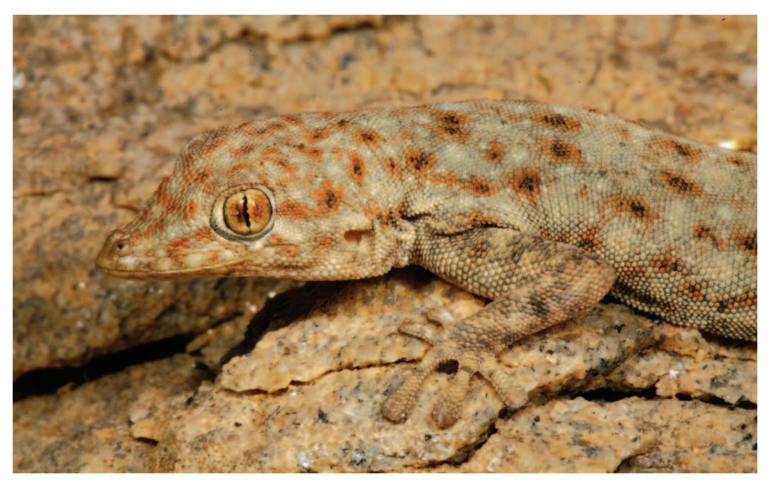
FIGURE 9. Close-up of head of adult specimen of Two-Pored Namib Day Gecko, Rhoptropus biporosus FitzSimons, 1957 from northwest of Palmwag, Kunene Region, Namibia.

16°48′43.19″S, 12°16′16.55″E, 485 m (CAS 254959), Espinheira, 29 November 2013, 16°47′19.9″S, 12°21′27.4″E, 457 m (CAS 254794), 16°47′7.08″S, 12°21′16.02″E, 457 m (CAS 254802–254803), 16°47′7.02″S, 12°21′16.86″E, 457 m (CAS 254805), 16°47′4.26″S, 12°21′16.62″E, 457 m (CAS 254811), 16°47′12.71″S, 12°21′28.67″E, 457 m (CAS 254813), 16°47′20.2″S, 12°21′27.9″E, 457 m (CAS 254958), 30 November 2013, 16°47′14.3″S, 12°21′29.4″E (CAS 254820), 16°47′8.7″S, 12°21′30.3″E, 457 m (CAS 254821), 16°47′18.1″S, 12°21′26.2″E, 457 m (CAS 254822), 16°47′33.6′S, 12°21′19.0″E, 457 m (CAS 254823), 16°47′41.5″S, 12°21′17.3″E, 457 m (CAS 254824), 16°47′45.3″S, 12°21′15.9″E, 457 m (CAS 254825); NNP, 28 November 2013, 15°46′27.4″S, 12°19′59.2″E, 264 m (CAS 254957–254958).