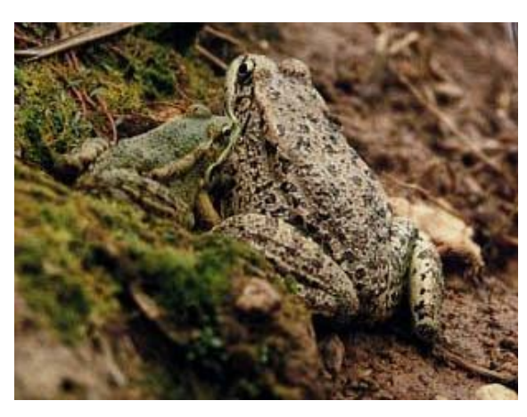
Colour varieties of the Crete Great Green Frog (Rana cretensis).

Dropped off early in the morning by our Greek friend Jiannis Frudarakis, I spent 6 hours in the blazing heat (with temperatures that exceeded 30°C in the shade) observing frogs, snakes, and turtles, before returning on Jiannis' mountain bike.