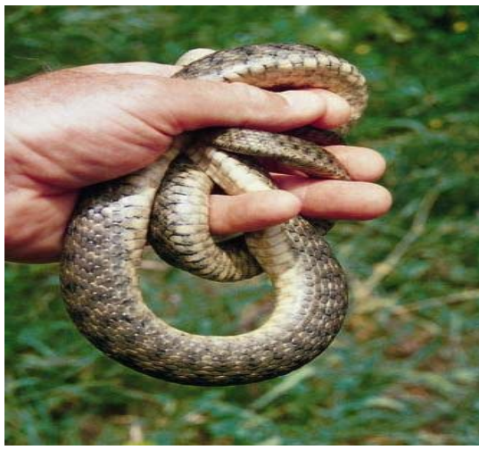
Dice Snake, Natrix tessellata.