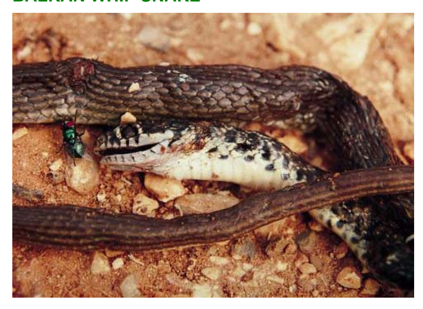
Dead Balkan Whip Snake, Coluber gemonensis.