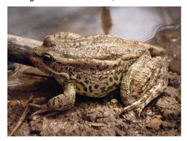
Crete Great Green Frog (Rana cretensis).

The town of Mochós is located in the mountains approximately nine kilometers from Stalis, at an elevation of about 250 to 300 m, according to the locals. In the back country is a small lake with a diameter of roughly 100 m, which is only accessible by two nearly impassible, unpaved and dusty roads. If not pointed out by the locals, most tourists will not notice this body of water. During the winter months, rain water that runs down from the mountains is collected here to be