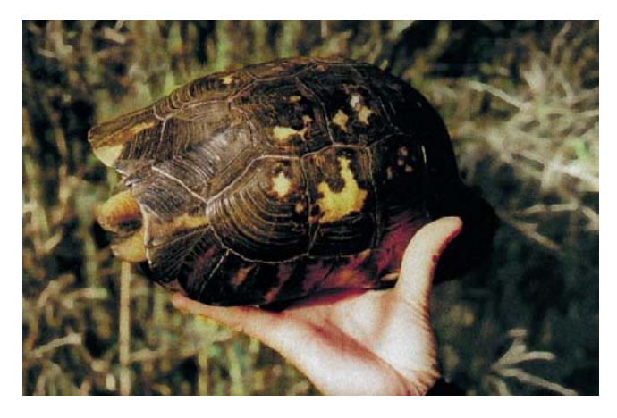
The carapace of Testudo marginata.