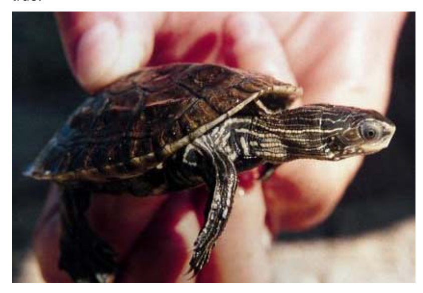
Juvenile Caspian Stream Turtle, Mauremys rivulata.

The beach town of Mália is situated about 7 km east of Stalis. A relative told us that we could find a small brook here, which empties into the Mediterranean. This brook would harbor turtles, and could easily be reached on a bicycle by following the coastal road. All this turned out to be true.