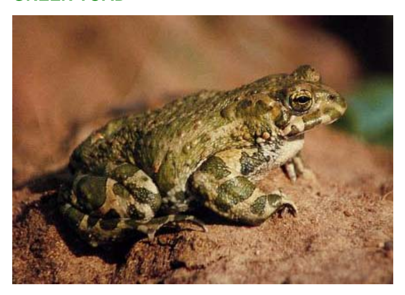
Green Toad, Bufo viridis.