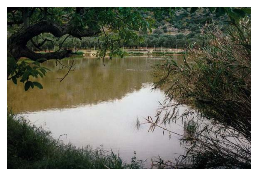
The lake near Mochós. Habitat of the Caspian Stream Turtle, Tree Frog, Green Frog and Dice Snake.