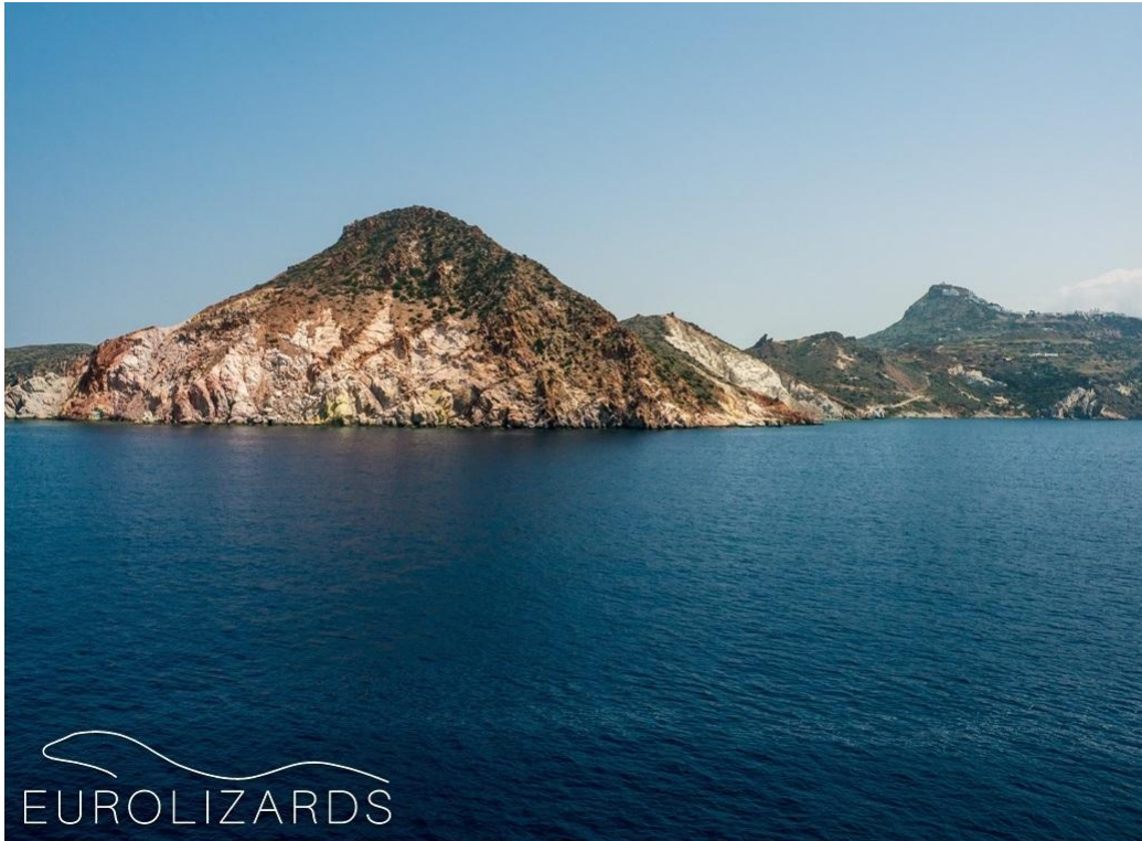
The volcanic island of Milos - home of Podarcis milensis .