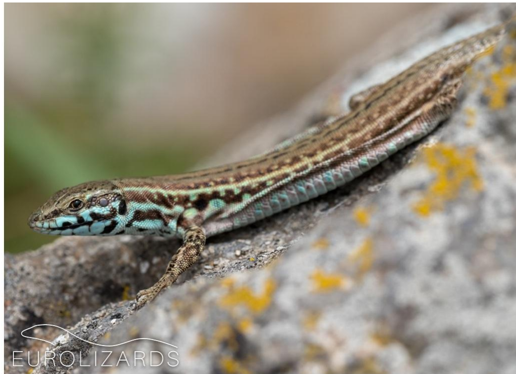
Female: GR / Milos, 15.04.2018 - Females sometimes show a light blue throat.