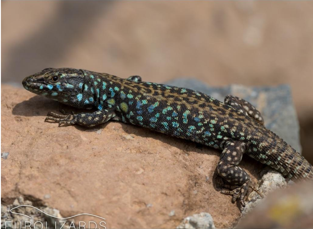
Male: GR / Milos, 17.04.2018 - Black flanks with blue dots make these lizards unmistakable.

A legendary species: The endemic Milos Wall Lizard is one of the most beautiful European Lacertids. Although being closely related to the Skyros Wall Lizard , it looks quite different - with the males showing black colours with blue dots. Maybe the volcanic substrate in its habitat has supported the development of this colouration. Anyway, it's remarkable how these lizards resemble to some colour morphs of the - not closely related - Maltese Wall Lizard . Howbeit, the Milos Wall Lizards (and some more Milos endemics) have attracted generations of fieldherpers.