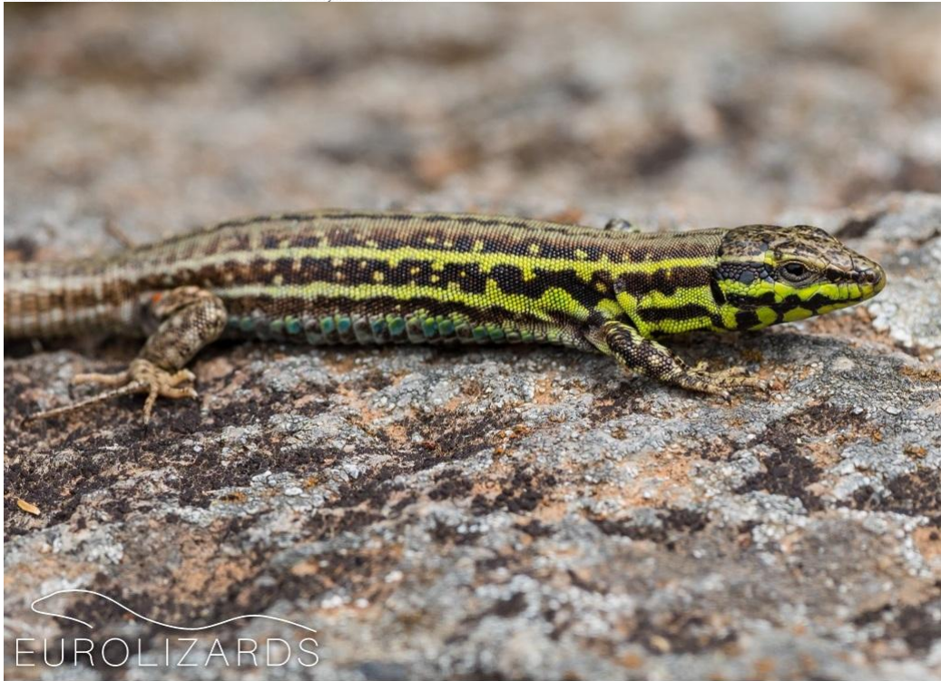
Female: GR / Milos, 15.04.2018 - This extraordinary specimen shows bright yellow colours.