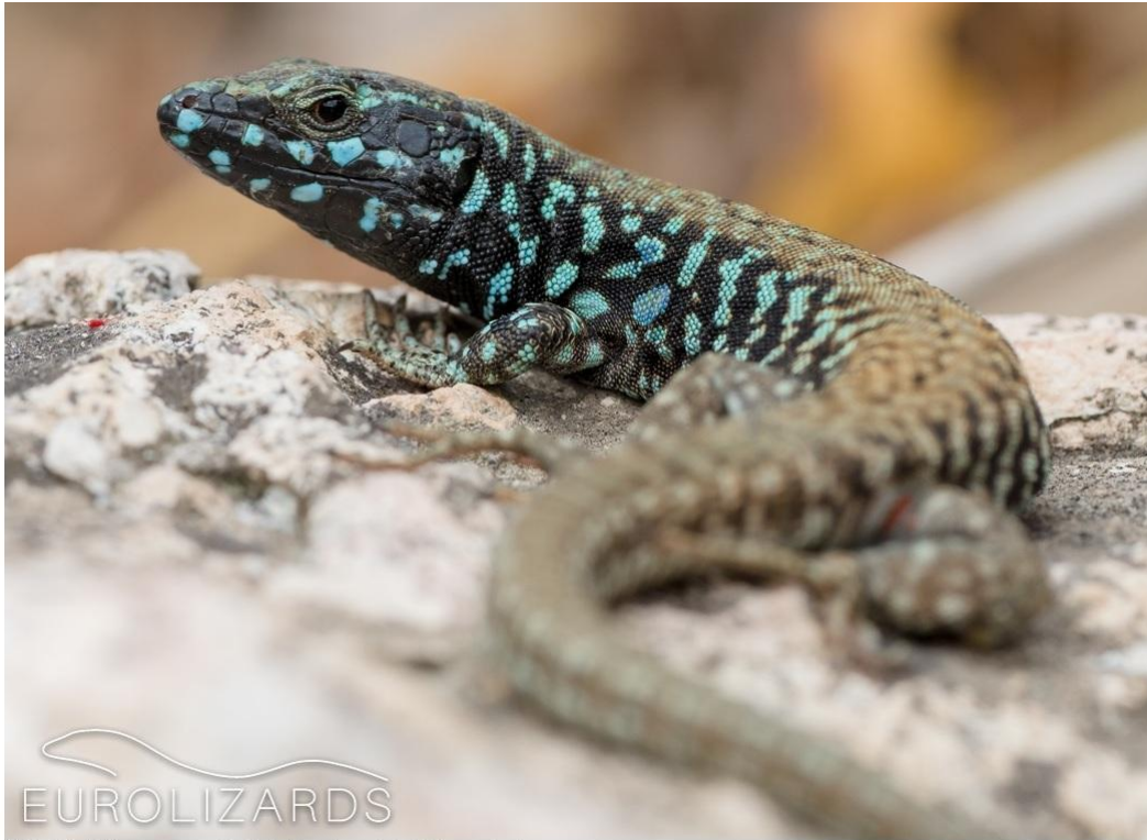
Male: GR / Milos, 15.04.2018 - Note the characteristic brown back.