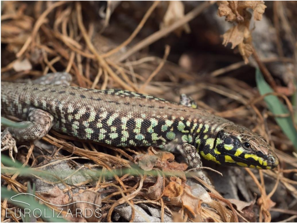
Male: GR / Milos, 17.04.2018 - Some males show yellow colours.