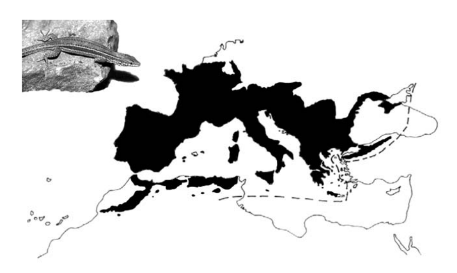
Figure 1 Distribution of the genus Podarcis (modified from Arnold 1973). The lizard in the image is a female Podarcis liolepis . The dashed line indicates the estern boundary.

As in other groups, the generalization of molecular tools is gradually revealing more evolutionary complexity in Podarcis than previously thought. The Iberian Peninsula, a region with high habitat diversity and complex geological history, is no exception. However, there is a risk that phylogenetic works ignore their own taxonomic results or