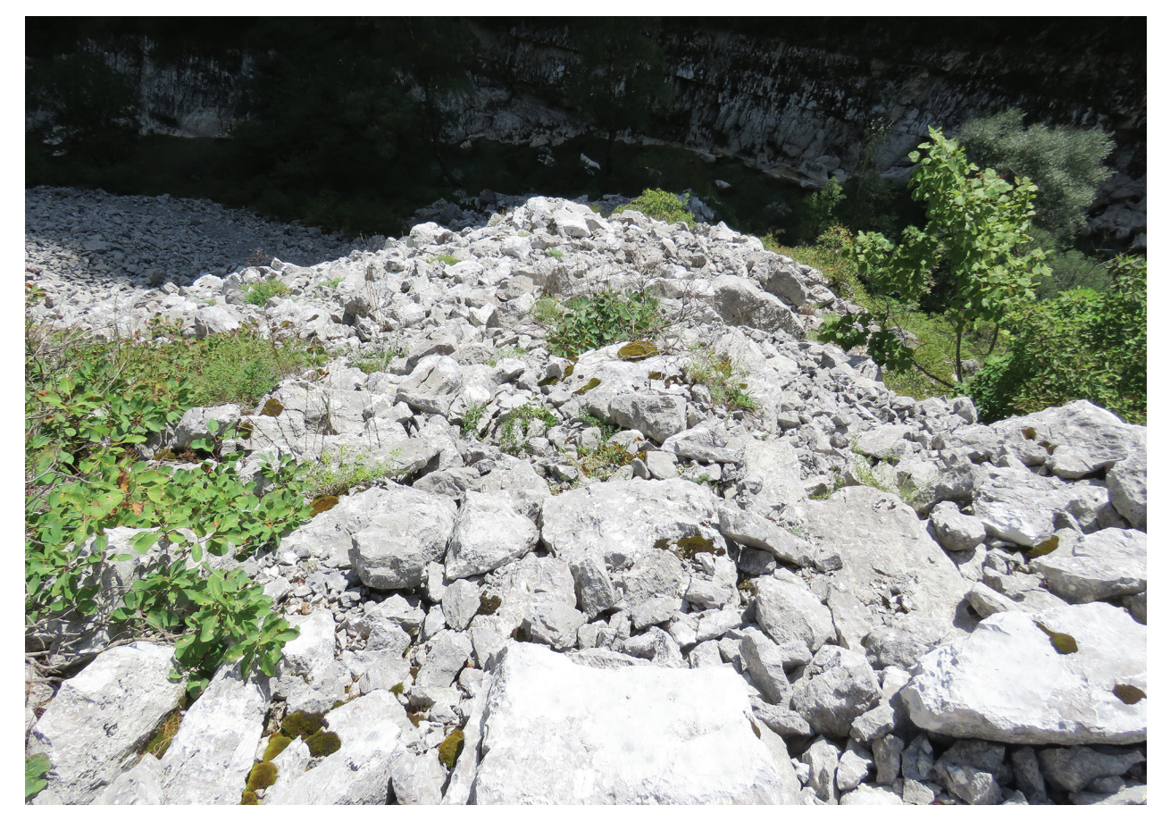
Figure 3. Microhabitat of the Sharp-snouted rock lizard ( Dalmatolacerta oxycephala ) in the middle part of the Komarnica canyon.

Ljubisavljević et al. (2018) mentioned that the rapid urbanization and the increase of touristic infrastructure is a general threat for local coastal populations of endemic lizard species in Montenegro, which includes D. oxycephala. We would add that there are similar challenges for the mainland populations of this species as well, particularly for refugial ones scattered in canyons, as it could be the case with this new recorded one in the mid-part of the Komarnica Canyon. An increase in anthropogenic activities that inevitably alter or destroy natural habitats in this part of the Eastern Mediterranean region would jeopardize the stability of local Sharp-snouted rock lizard populations, as well as other endemic, threatened, Natura 2000, or in some other aspect important wild species. According to Böhm et al. (2013), human-induced habitat loss is one of the predominant threats to reptiles, and the distribution and severity of those threats will shape the future fortune of reptiles. Careful and responsible planning of economic development in Northern Montenegro should support ecological tourism as an adequate solution for the increase of living standards, without harming the local wildlife populations by severe anthropogenic alterations of the landscape.