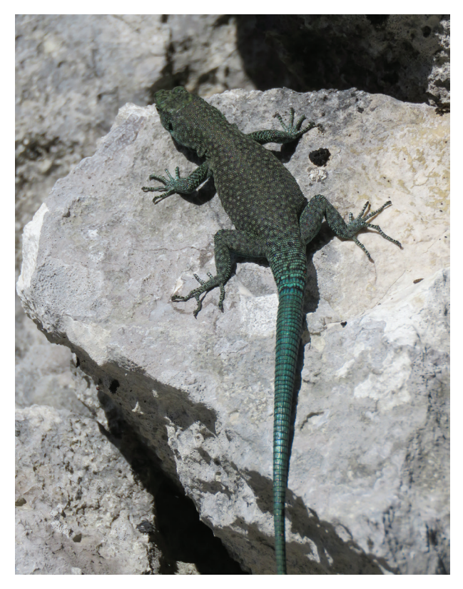
Figure 2. Sharp-snouted rock lizard ( Dalmatolacerta oxyceph-ala ) from the Komarnica canyon.

characterized this species as highly specialized regarding habitat choice (Bejaković et al. 1996b). This suggests a lower potential for survival in non-optimal environmental conditions.