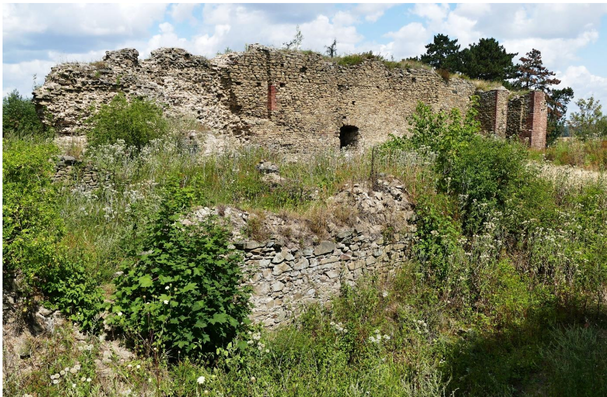
Fig 2: The ruins of the Šelenburk castle near the town Krnov where the population of common wall lizard ( P. muralis ) was discovered on August 2019. Photo by P. Vlček, 4.8.2019.