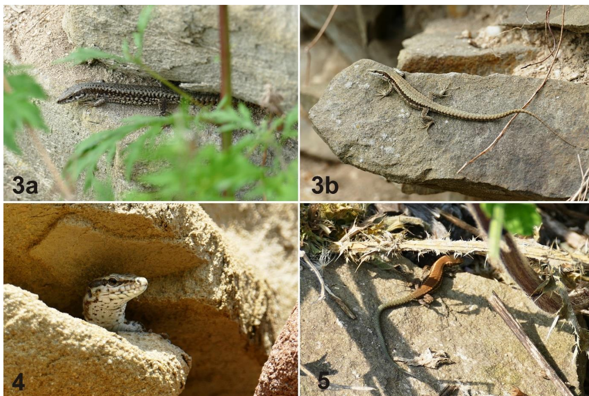
Figs 3-5: 3 - Male (a) and most likely female (b) of the common wall lizard ( P. muralis) on the wall of the Šelenburk castle in the Bruntál region (Czech Silesia). 4 - Numerous defects and cracks of the castle walls provide for common wall lizards ( P. muralis) ideal conditions. 5 - Freshly hatched individual of common wall lizard ( P. muralis) from Šelenburk castle.