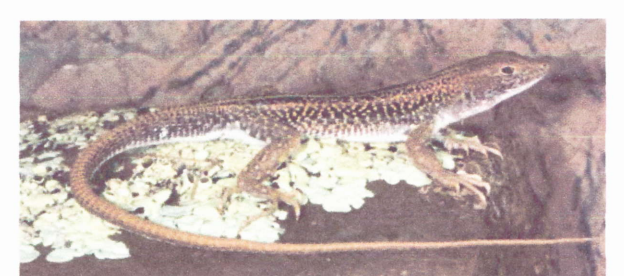
Pedioplanis laticeps-Sutherland, NC