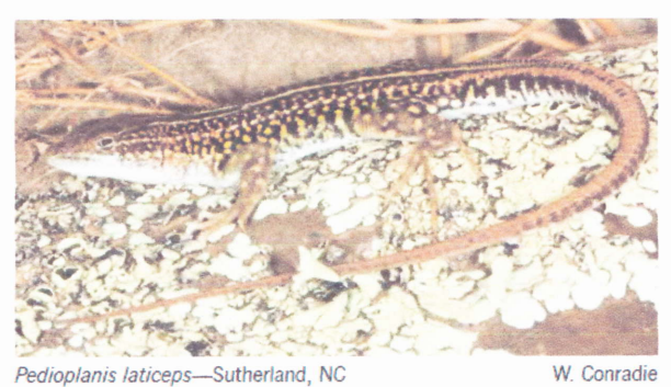
Pedioplanis laticeps-Sutherland, NC

Distribution: Endemic to South Africa. Occurs widely from the Orange River in the north to Anysberg in the south and Graaff-Reinet in the east. Branch (1990a) noted that old, unvouchered records of P. laticeps (as Eremias capensis) from localities on the western Cape coast (Papendorp,