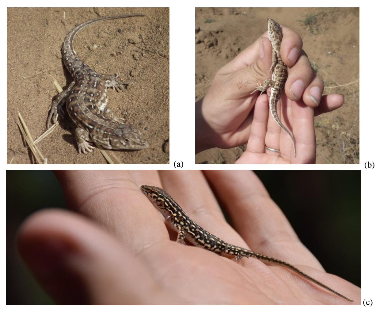
Figure 2. Steppe-runners Eremias arguta from sites 5 (a), 6 (b) and 11 (c).

IOP Conf. Series: Earth and Environmental Science 817 (2021) 012008 doi:10.1088/1755-1315/817/1/012008