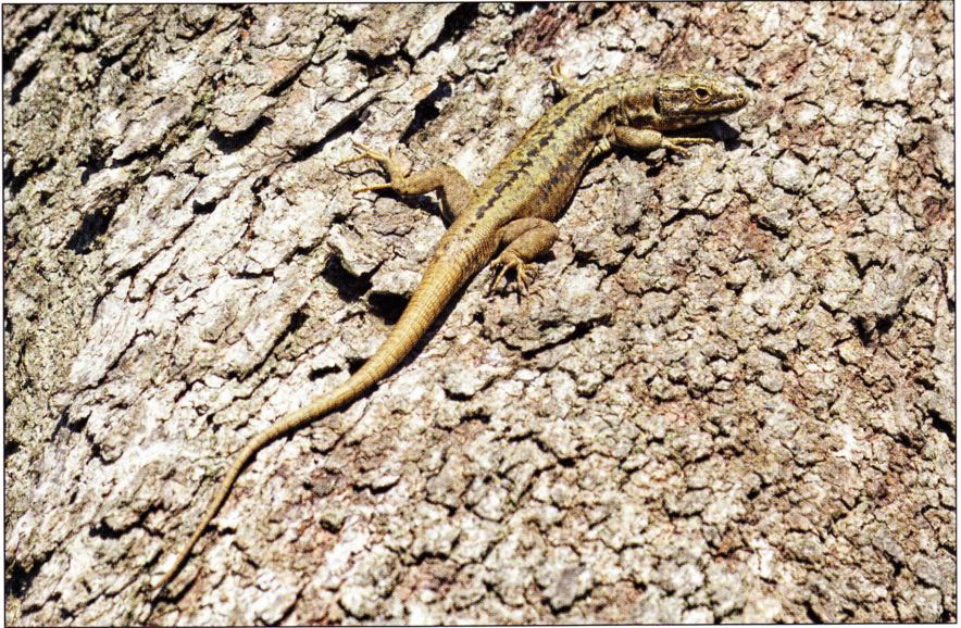
Fig. 208: Large Podarcis muralis male with unusual pattern.

It has been suggested that P. muralis also may occur along the Corfu coast further north but there is no documentation to support this. The species can locally reach high densities, but the population on Corfu is very small and may consist of as few as 20 adult individuals only. The Common wall lizard is a small species, reaching a total length of about 20 cm with the tail making up about 2/3. The body is rather flat and the colour is usually light brown with white markings, especially on the chin and lips, something that is characteristic for this species. There are no green or blue colours and the males are similar to but slightly larger than the females. This species can be distinguished from A. nigropunctatus by lacking distinctly keeled dorsal scales and usually at least some blue colouring of the chin, and from Podarcis tauricus by entirely lacking green colours.