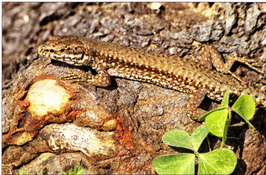
Fig. 206: Podarcis muralis has almost no striking colours, not even during the mating season (Corfu town, early May).