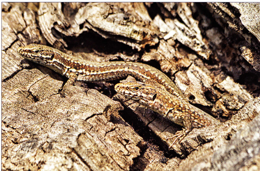
Fig. 207: Podarcis muralis .