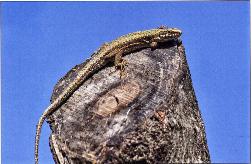
Fig. 205: Podarcis muralis is only found in a small area in Corfu town.

The first reported observation of wall lizards in Corfu was made in 2003 in a small area below the New Fortress in the city of Corfu, but it may have been observed already in 1993. The small area in question is a square close to the harbour, surrounded by roads and buildings on three sides and it is very busy during the tourist season. These often anthropophilic lizards inhabit the trees around the square but have never been observed outside this area despite the fact that there are more suitable habitats within a 100 m, i.e. the extensive walls and vegetation of the fortress itself. Originally some 30 specimens were observed, but we have never seen more than 10 at any one time but all in good condition. This very unlikely place, which has also been subject to recent structural changes, seems to have been able to support a small breeding population during the last 12 or perhaps even 22 years. This is remarkable in itself, but even more so considering that there are an additional two lizard species utilising the same area and the same trees, Algyroides nigropunctatus and Laudakia stellio , both competitors to the wall lizard and the latter also a potential predator. These species are rather common and frequently also found on the walls of the fortress. Lacerta tri-lineata is present within the fortress area, but it is less common and not found in the square.