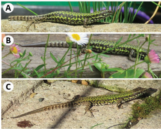
Figure 3. Tail regeneration in an adult female Podarcis muralis (F2) in 2022 - A. Soon after tail loss on 27 May while still gravid, B. After 33 days (30 June) when eggs had been laid and with significant tail regeneration, and C. After 52 days (18 July) with further regeneration