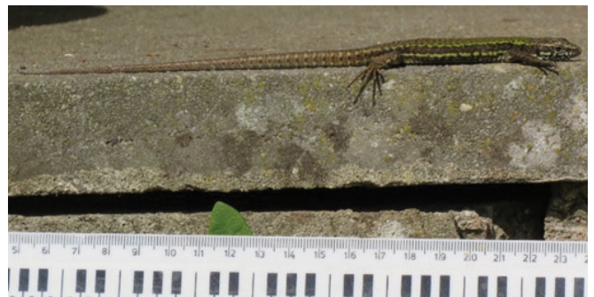
Figure 1. A female lizard on the paving slab with the ruler used to measure length

The observations on male and female specimens were made in two different years, 2021 and 2022. In the period April to the end of July, these years showed marked differences