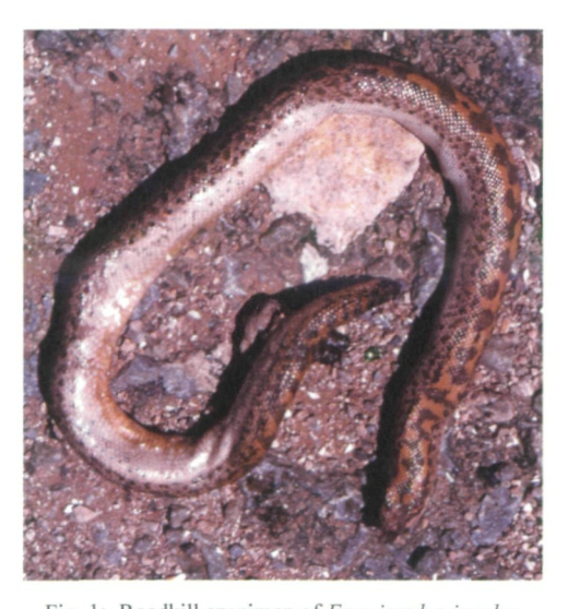
Fig. 1: Roadkill specimen of Eryx jaculus jaculus (LINNAEUS, 1758) found between Hassi Berkane and the "Barrage Mohammed V" reservoir, NE Morocco.

The Western Sand Boa, Eryx jaculus jaculus (LINNAEUS, 1758) inhabits the Mediterranean coastal areas and Maghrebinian high plateaus of North Africa, from Egypt in the East to Morocco in the West where the limit of its range, so far known, is marked by