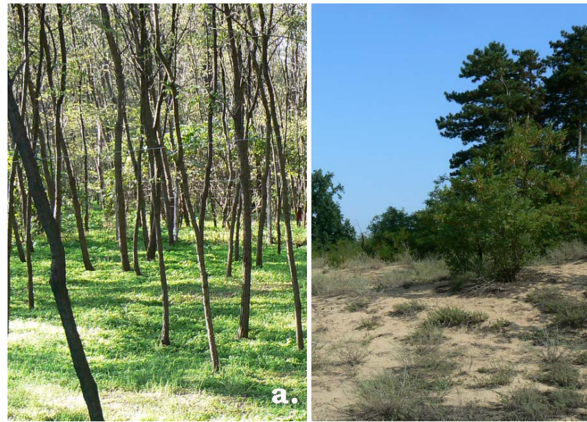
Figure no.3 A - Aspect of the "Hanu Conachi River Sand Dunes" Nature Reserve with R. pseudoacacia plantations B - The steppe runner habitat inside the reserve