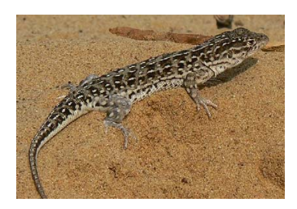
Figure no.2 Adult E. a. deserti from "Hanu Conachi"

22°C. There is a very low level of precipitation, with average annual values of 400 mm. The reserve is situated at altitudes of between 14 m a.s.l. in the southern areas of the Reserve to 20.5 m a.s.l. in its central area.