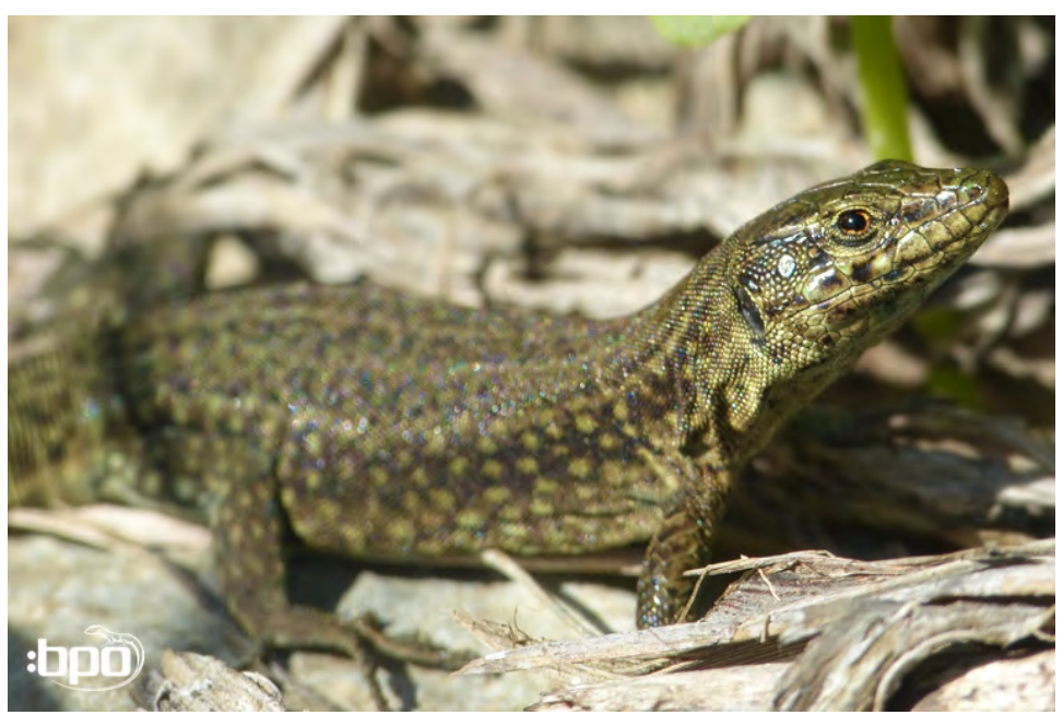
\label{podarcis} \mbox{Podarcis lilfordi: note the large masseteric shield}

After this successful excursion we wanted to try it again at another place: The Escull de Binicodrell off the south coast of Menorca is the habitat of subspecies Podarcis lilfordi codrollensis. The way to the islands was a challenge (strong waves, cold water getting deeper and deeper, swimming for the last 15 meters). The Escull de Binicodrell Gros is a bare, rocky islet which surprises with a large lizard population - a fascinating place!