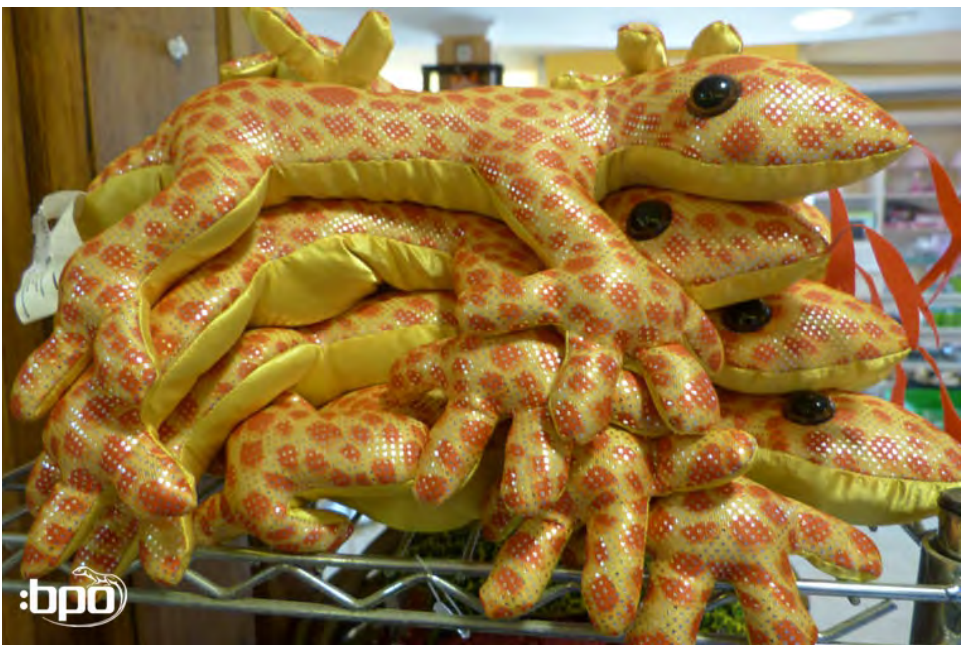
Found in high population density.