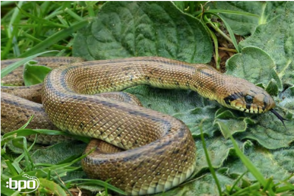
he first finding on Menorca: a subadult Rhinechis scalaris.