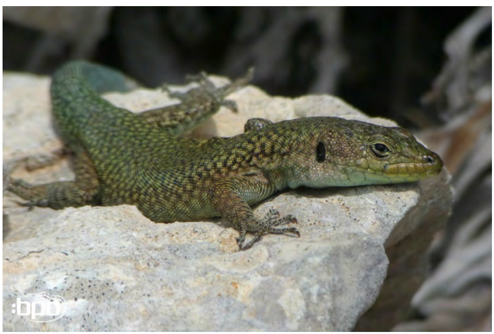
..another specimen with nice coloration