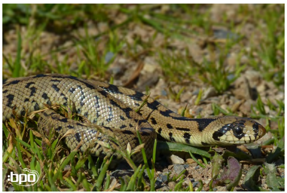
enile Rhinechis scalaris - these animals just don't stand still and are therefore difficult to photograph.