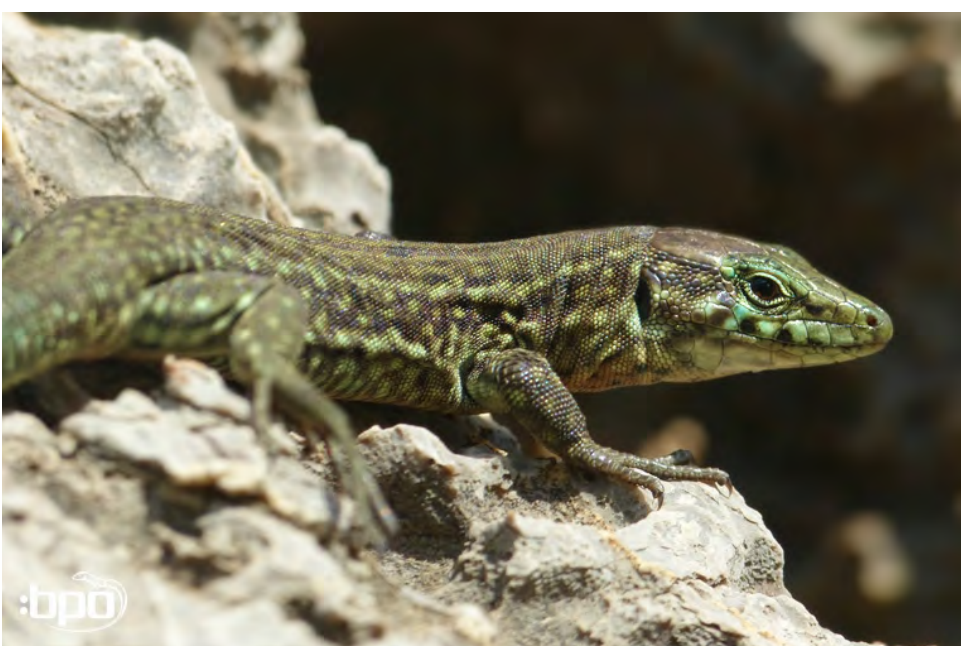
Subadult Podarcis lilfordi - the population of Ses Mones has not been described as a distinct subspecies so far.