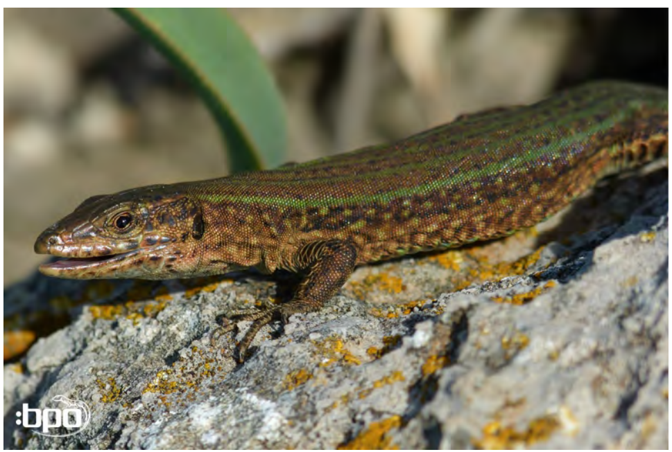
Podarcis lilfordi addayae