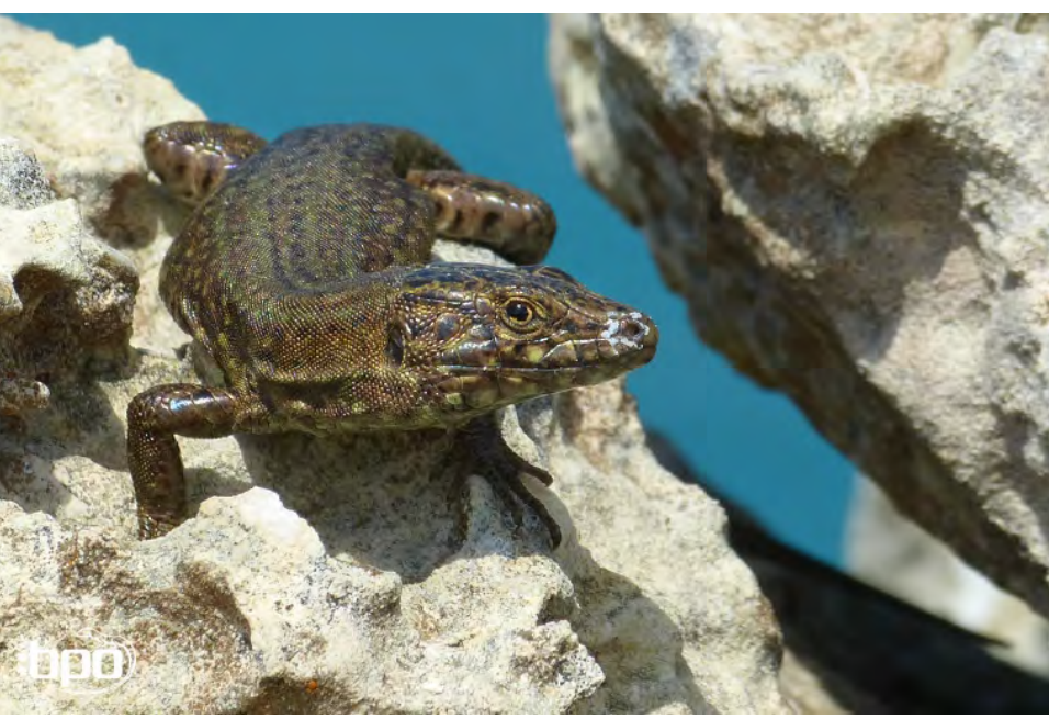
...a dark brown colored animal.