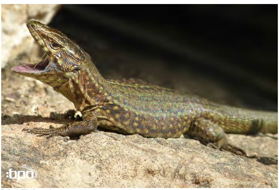
Podarcis lilfordi, yawning