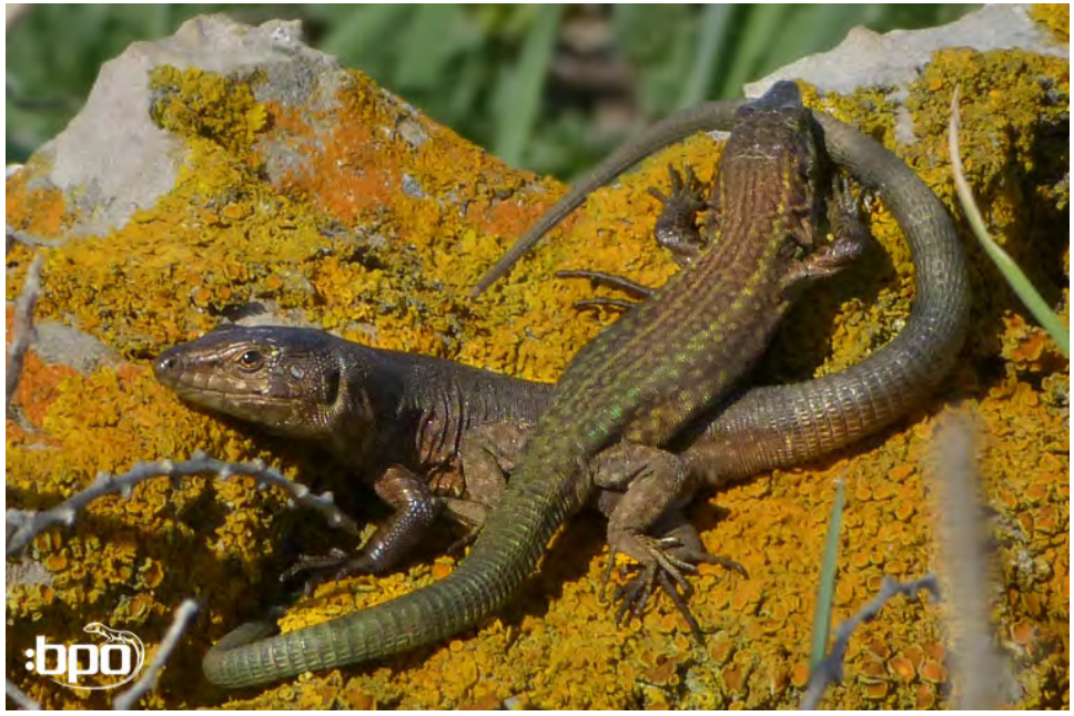
A pair of Podarcis lilfordi addayae..