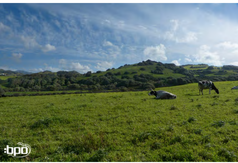
Pastures dominate the landscape in Menorca..