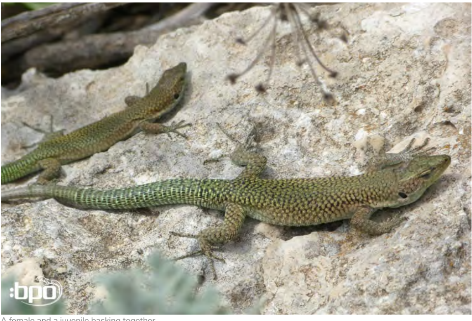
A female and a juvenile basking together