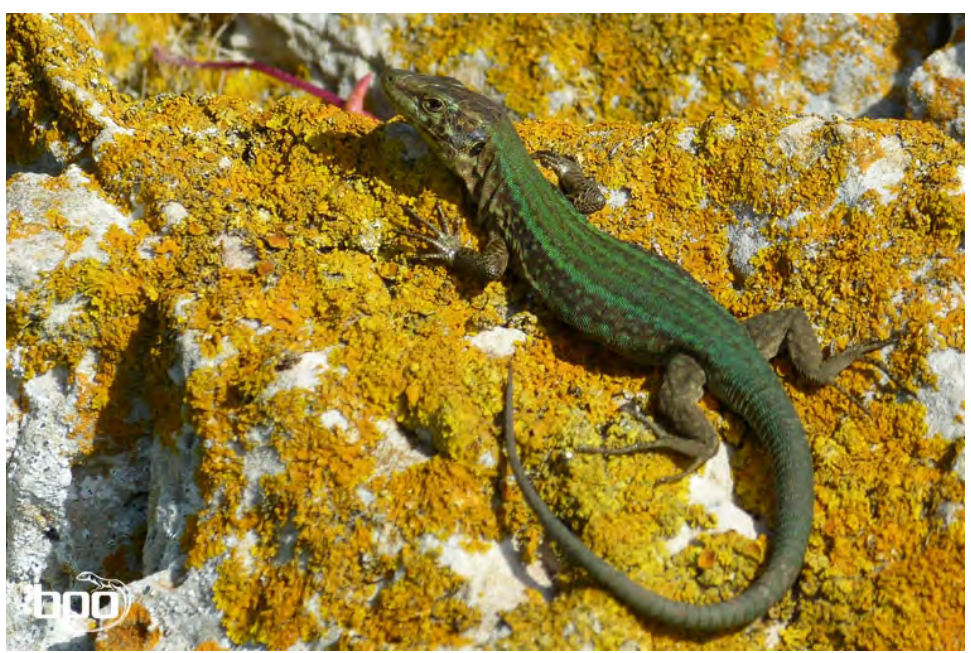
A green-backed female