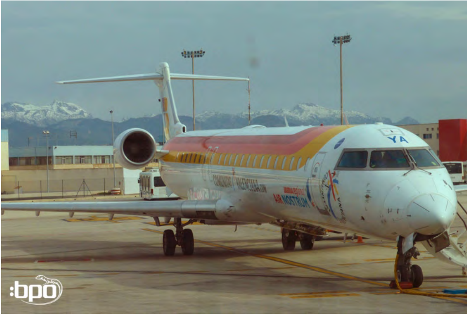
Snow on Mallorca