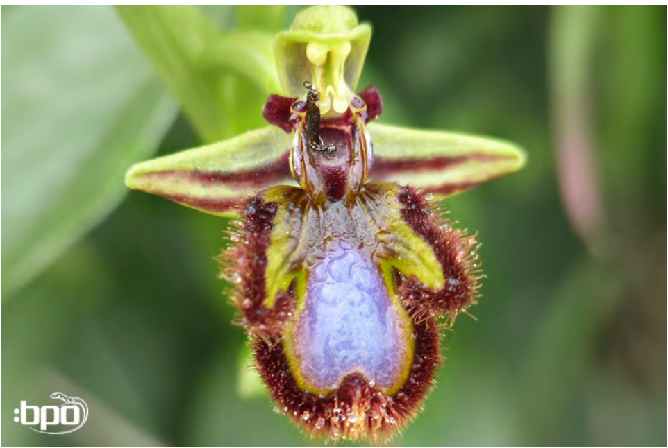
Ophrys speculum – note the microscopic ants working on that flower