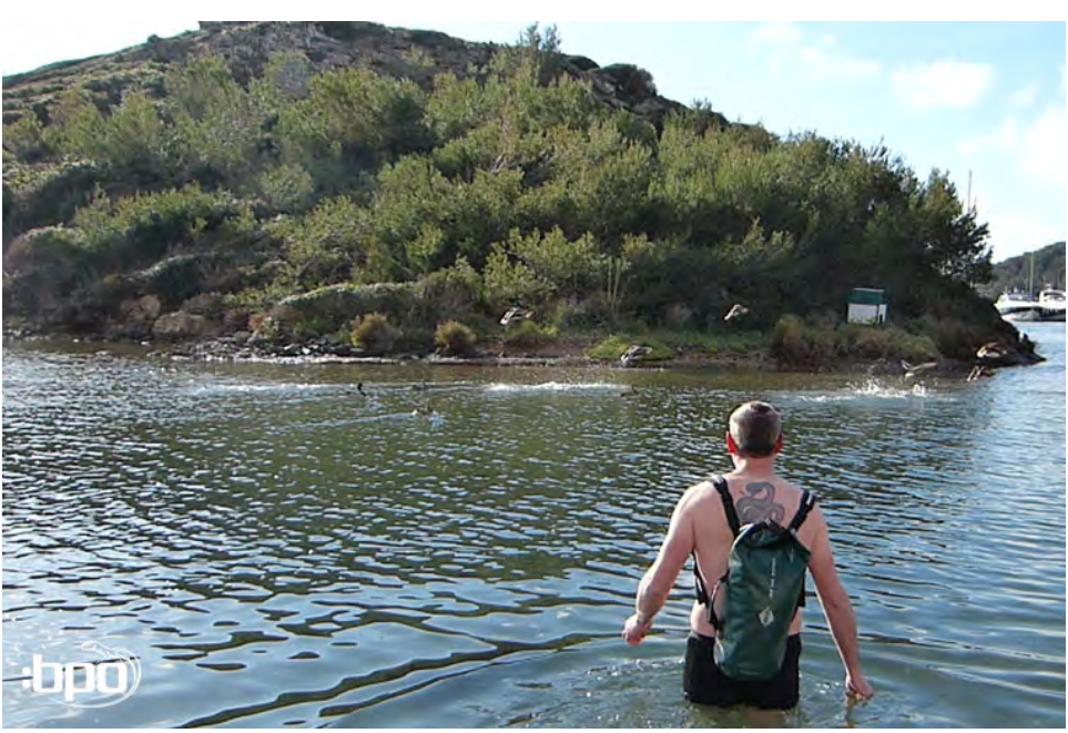
On the way to Ses Mones

Our next challenge: the Balearic lizard (Podarcis lifordi) is extinct on Menorca but still occurs on several offshore islands and islets – with various subspecies. There has been much speculation about the reason for this species' extinction on Menorca – in particular, the introduced species Podarcis siculus and Macroprotodon cucullatus were suspected. For us, a direct displacement or extermination by these species seems unlikely - but perhaps there are epidemiological reasons? Anyway: At sunny weather we went to Port Addaia to find a boat to the islands - unfortunately without success. Hence, we had to take the direct route: The island of Ses Mones can be reached from Port Addaia wading through the shallow water. The Mediterranean is still very cold in March, but the island rewarded us with a Podarcis lifordi population – another new species for us!