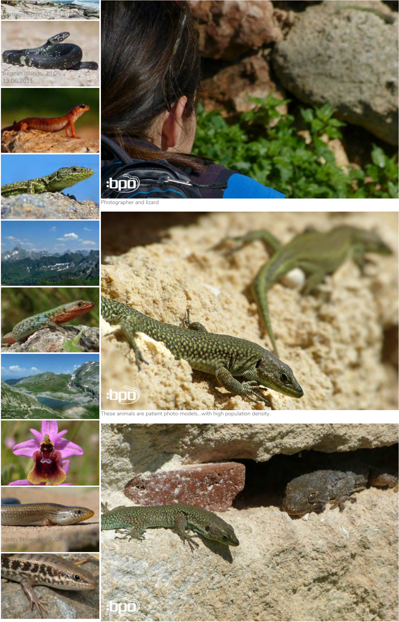
Teira - Tarentola flat-sharing community...