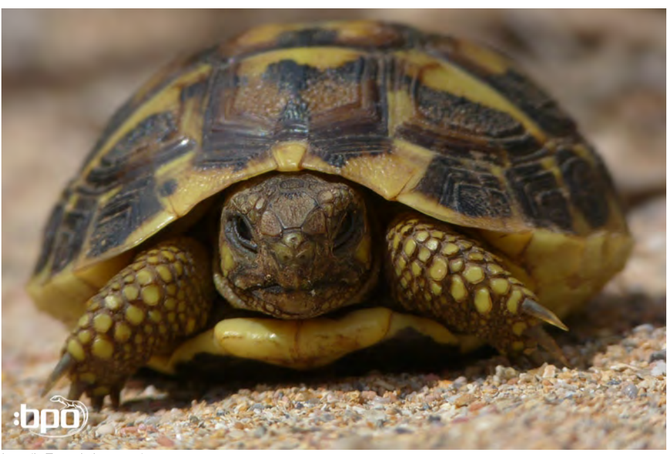
Juvenile Testudo hermanni