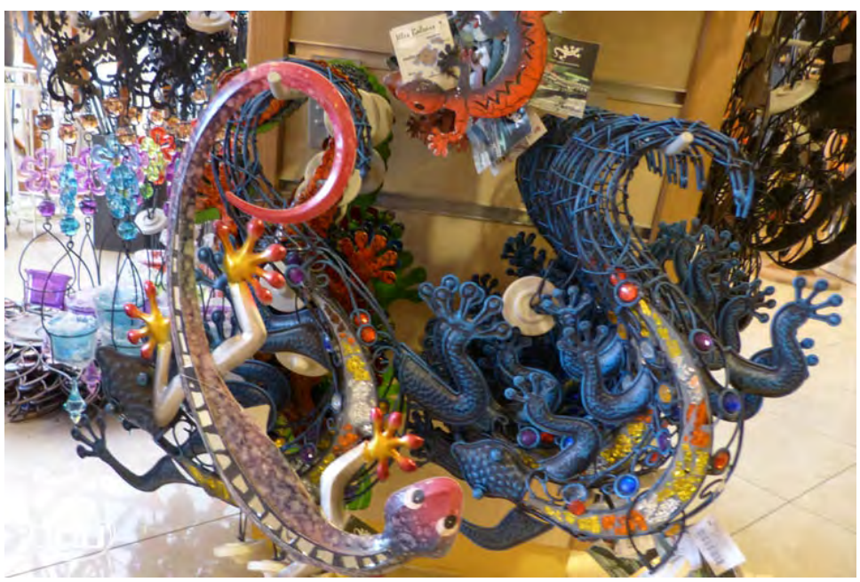
Searching lizards in Ciutadella (Podarcis commercialis):