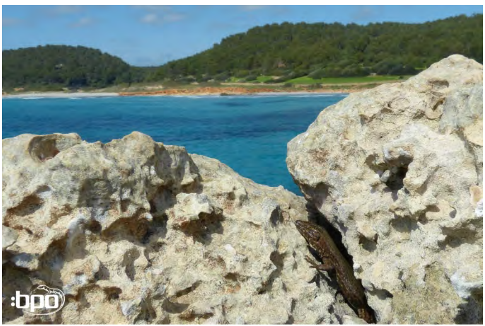
Home of Podarcis lilfordi codrollensis ...