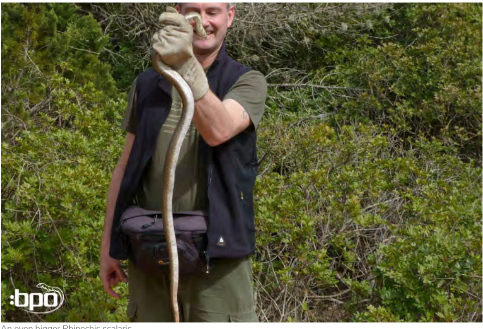
An even bigger Rhinechis scalaris.