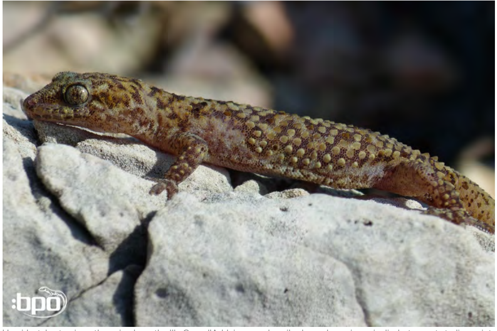
Hemidactylus turcicus: the animals on the Illa Gran d'Addaia were described as subspecies spinalis, but recent studies point out that this is not a valid subspecies.