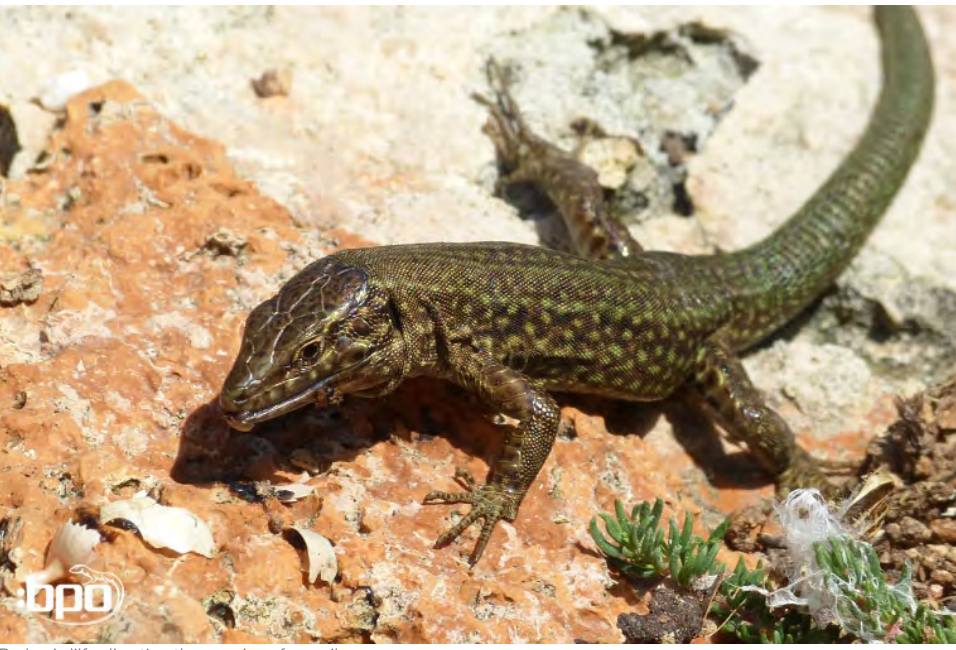
Podarcis lilfordi eating the remains of a snail

After the adventures on the islands we went to another snake place and found Rhinechis scalaris and: Macroprotodon cucullatus - the third new species for us. We had completed our twitching list within the first three days – from now on, we were deeply relaxed!