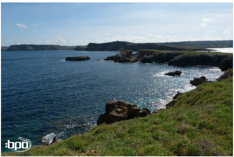
On Illa Gran d'Addaia