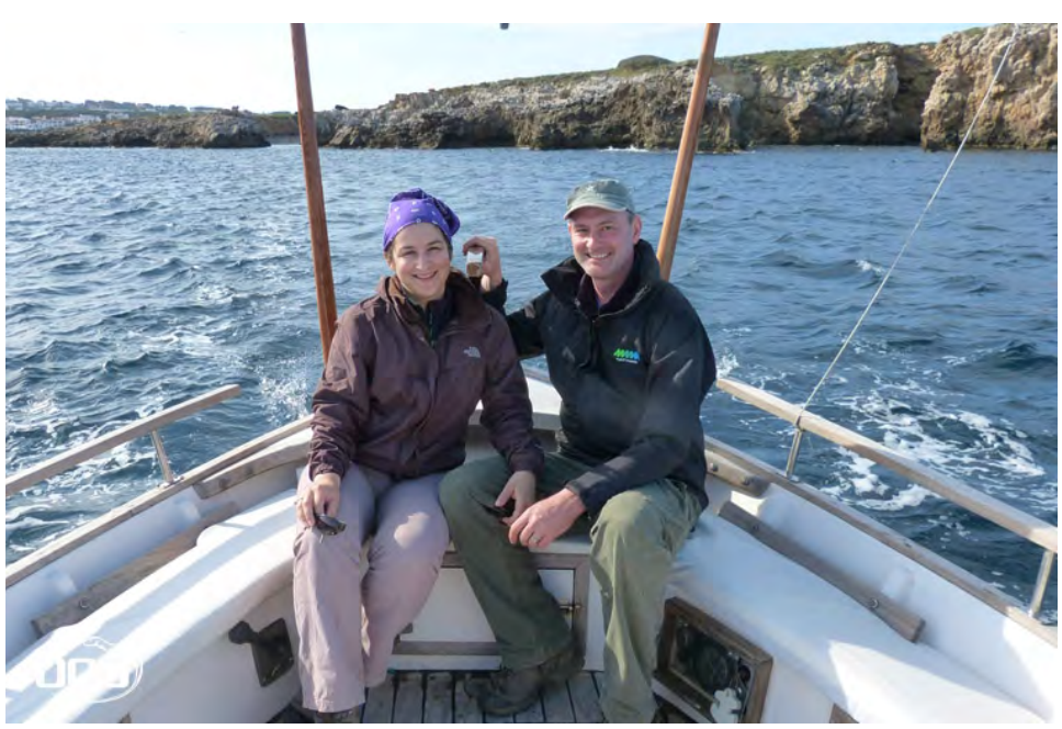
Visiting islands by boat is much more convenient than swimming!