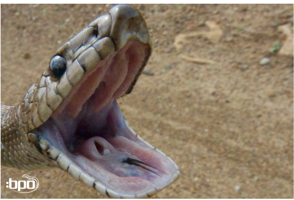
.reacted rather angrily to the photographer!