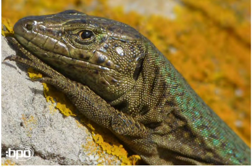
Portrait: at the windy weather, the animals seemed to have a preference for basking on lichens as these were warmer than the bare rocks.