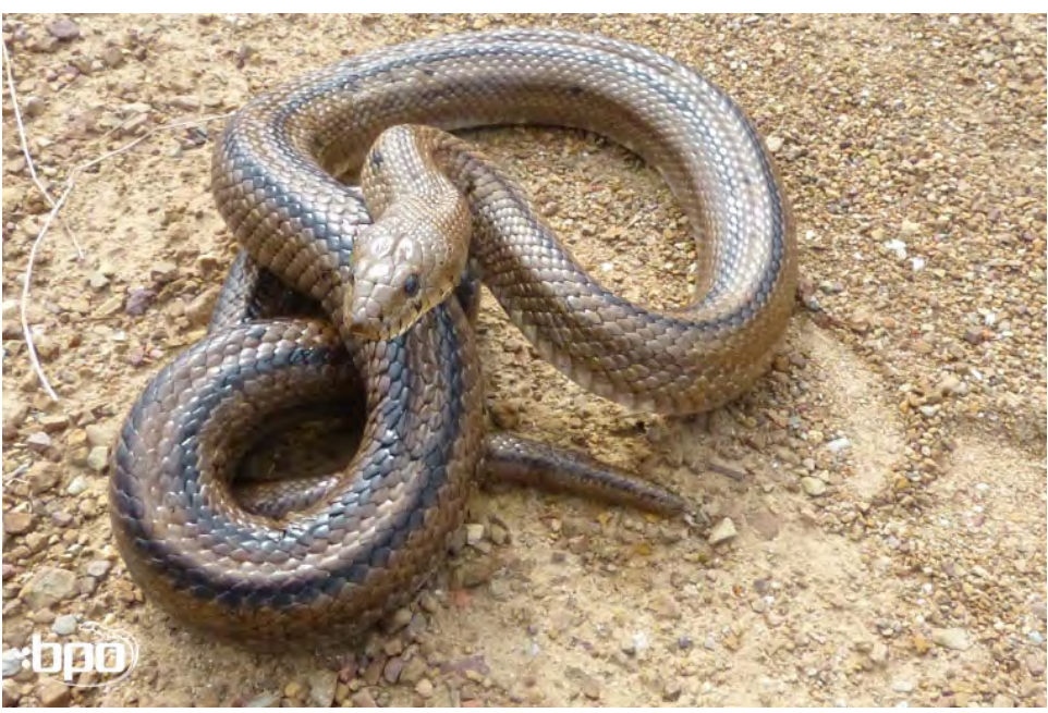
This very large Rhinechis scalaris..