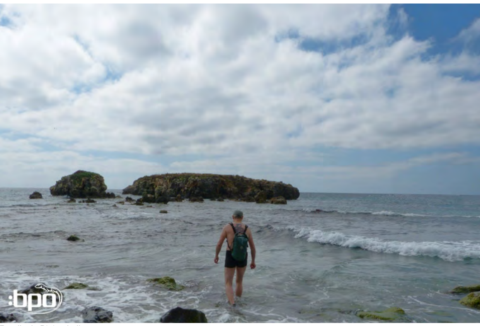
Esculls de Binicodrell..

After this successful excursion we wanted to try it again at another place: The Escull de Binicodrell off the south coast of Menorca is the habitat of subspecies Podarcis lilfordi codrollensis. The way to the islands was a challenge (strong waves, cold water getting deeper and deeper, swimming for the last 15 meters). The Escull de Binicodrell Gros is a bare, rocky islet which surprises with a large lizard population - a fascinating place!