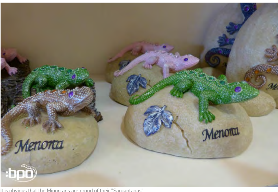
It is obvious that the Minorcans are proud of their "Sargantanas".