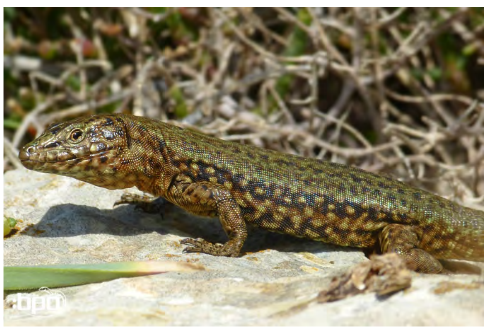
Podarcis lilfordi is a bold wall lizard with a massive head