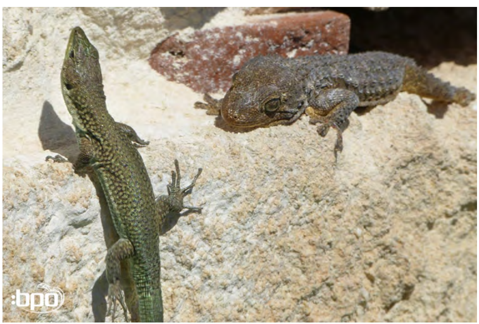
...the lizard showed respect for the gecko.