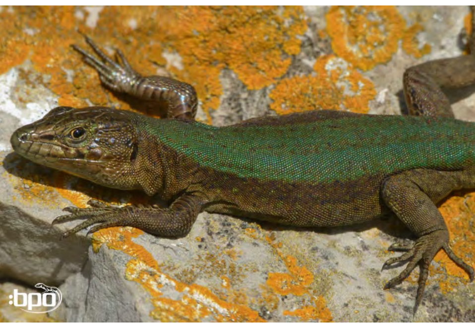
Another nice green-backed specimen