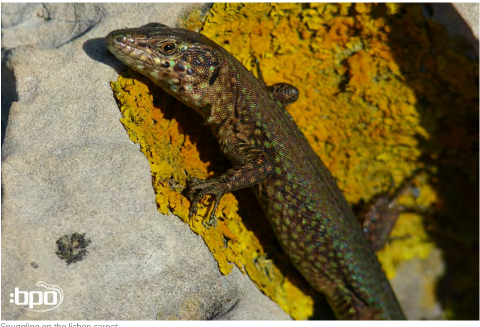
Snuggling on the lichen carpet...