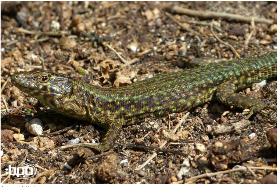
A green-dotted specimen