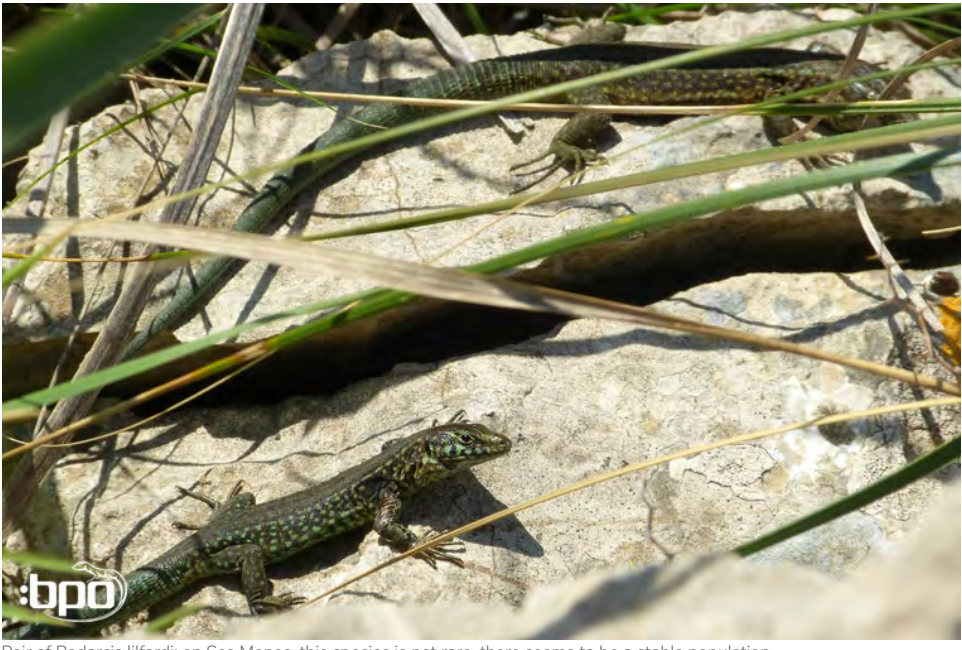
Pair of Podarcis lilfordi: on Ses Mones, this species is not rare, there seems to be a stable population.