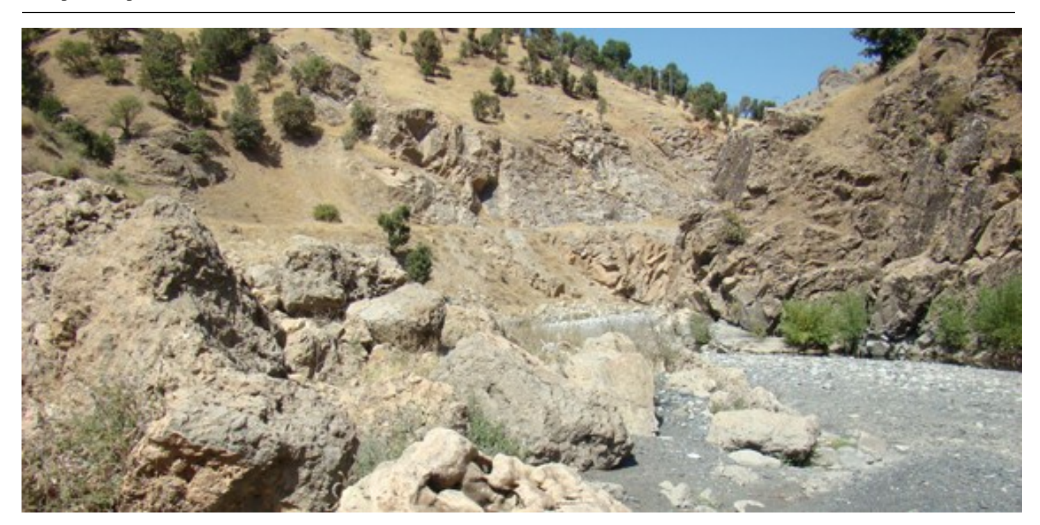
Fig. 4. The natural habitat of Apathya cappadocica muhtari from 40 km southwest of Baneh city in Blake River, 1287 m elevation, west of Kurdistan province, Iran. Image Zahed Bahmani .