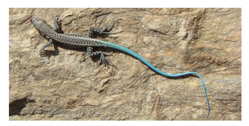
Fig. 3. Apathya cappadocica muhtari from Kurdistan province, Iran.

Ecological remarks. All specimens were observed in nature and were found in rocky and mountainous areas with scattered oaks ( Quercus sp. ). The specimens were collected in the afternoon (00-02 PM), in sunny and relatively warm conditions (Figure 4).