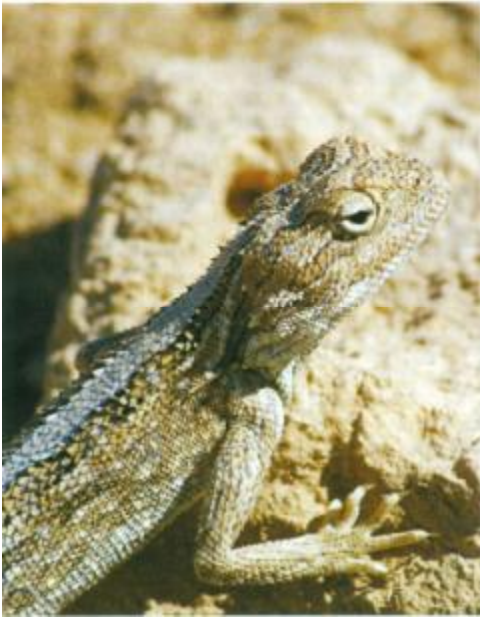
Fig. 1: Trapelus persicus fieldii (HAAS & Y. WERNER, 1969), male specimen, 50 km from Dair ez-Zour to Palmyra.

Abb. 1: Trapelus persicus fieldii (HAAS & Y. WERNER, 1969), Mannchen. Fund- ort: 50 km von Dair ez-Zour in Richtung Palmyra.