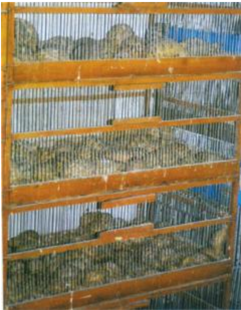
Fig. 3 (left): Testudo graeca terrestris FORSKAL, 1775 in cages in the animal market, downtown Damascus.

Abb. 2: Trapelus pallidus agnetae (F. WERNER, 1929), trachtiges Weibchen. Fundort: 50 km von Dair ez-Zour in Richtung Palmyra.