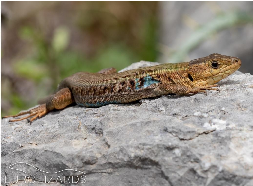
Subsp. peloponnesiacus, male: GR / Feneos, 08.04.2010 - Males may show stunning colours in spring.