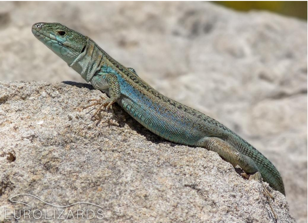
Subsp. thais, male: GR / Parnon, 04.04.2010 - This subspecies frequently shows whitish instead of orange throats.