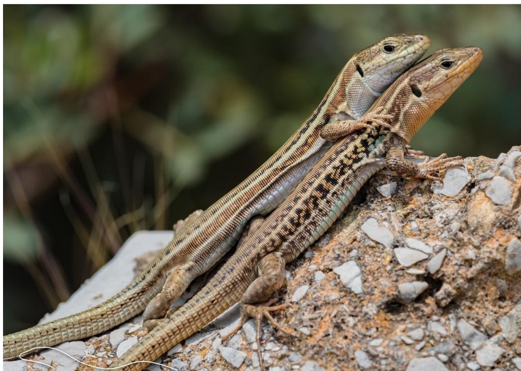
Subsp. peloponnesiacus, pair: GR / Santomeri, 29.05.2017 - Note the striped female which has the same size as the male. The lateral skin fold indicates that it has been ovipositing before.

The Peloponnese is a hotspot for endemism and thus, it may not surprise that it also holds a specific Wall Lizard species: Podarcis peloponnesiacus , a robust lizard with males often showing spectacular orange and blue colours in spring. This species can be found in rocky areas as well as in gardens and olive groves.