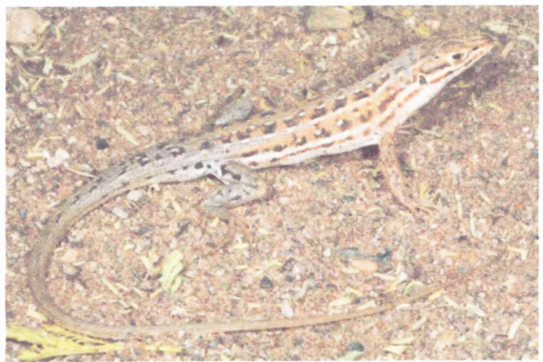
Meroles squamulosus—Greater Kuduland Safaris, E of Tshipise, LIMP