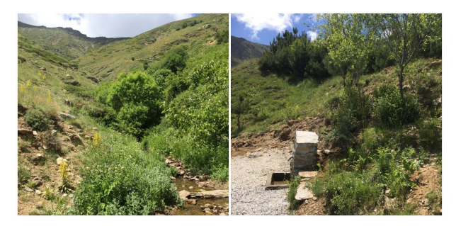
Figure 2 Habitat of Anatololacerta anatolica in Bozdağ, Izmir, in Turkey