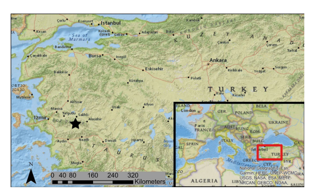
Figure 1 Map of the location where the feeding was observed

2013). Interestingly, the reported incident of saurophagy was observed in June, exactly in the period when females have to regulate their energy income to fuel reproduction (Waldschmidt et al. 1986).