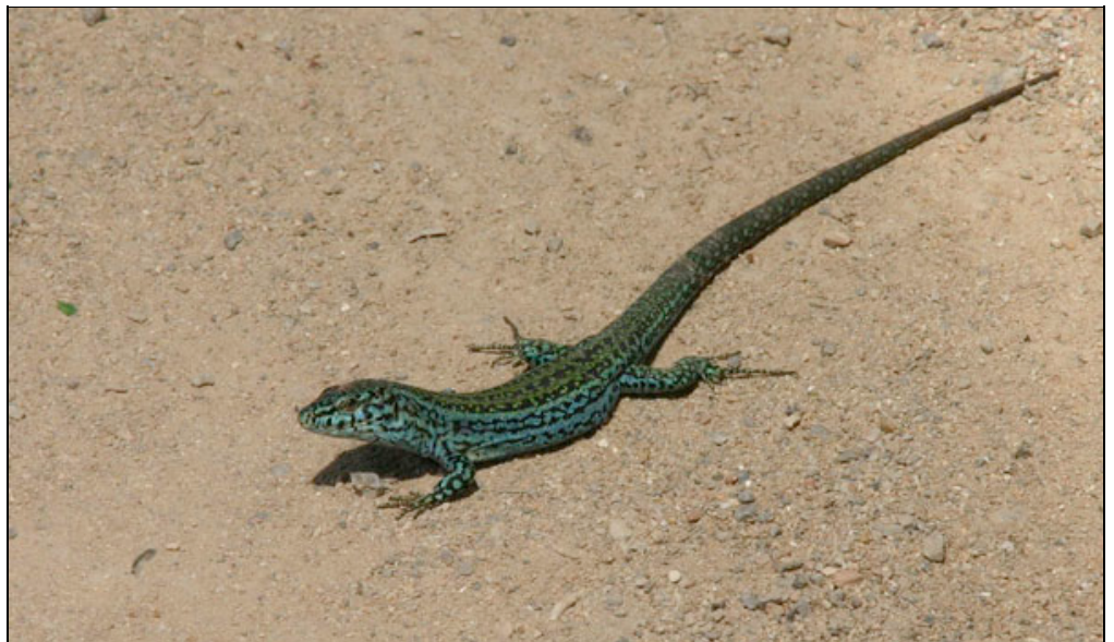
The Formentera sub-species of Ibiza Wall lizard ( Podarcis pityusensis formenterae )