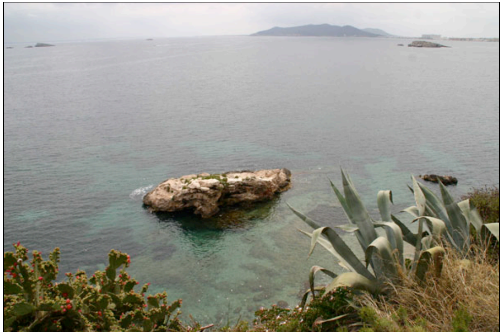
Scenery off of the coast of Ibiza

On 17th May I took a small boat across to Formentera which is one of the most beautiful places I have ever visited, and it was a pity I did not have longer to explore it than the few allocated hours. Whereas all my friends went to the beach I wandered off behind the small harbour and immediately found some nice habitats where I first saw the wonderful blue coloured male wall lizards, typical for the Formentera subspecies. This is without doubt one of the most beautiful lizards I have seen in Europe, and I was amazed by the amount of animals basking in small trees and in high bushes, but sadly I never actually got a photo of this behaviour before they leaped to the ground and took cover. Whilst exploring some cultivated land on this very flat, sandy island I had a quick chat with a local farmer. I asked him if he had ever seen snakes on Formentera to which he replied "Si claro, hay culebras aqui, de hecho se encuentra una de un metro" which translates as "yeh sure, there are snakes here, in fact there is one that grows up to a metre in length". So maybe there are snakes there after all, clearly these islands need a more thorough exploration.