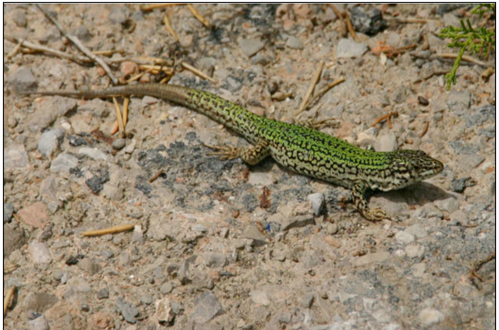
The Ibiza sub-species of Ibiza Wall lizard ( Podarcis pityusensis pityusensis )