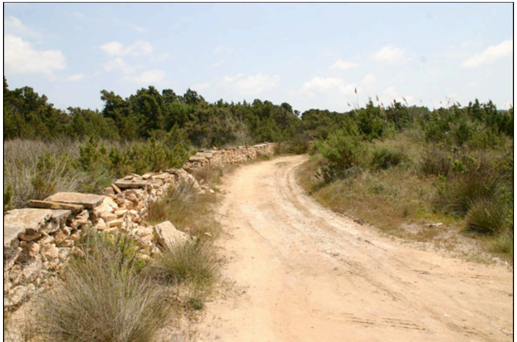
Habitat of the Ibiza Wall lizard ( Podarcis pityusensis formenterae )