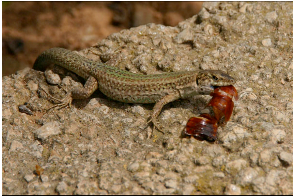
The Ibiza sub-species of Ibiza Wall lizard ( Podarcis pityusensis pityusensis )