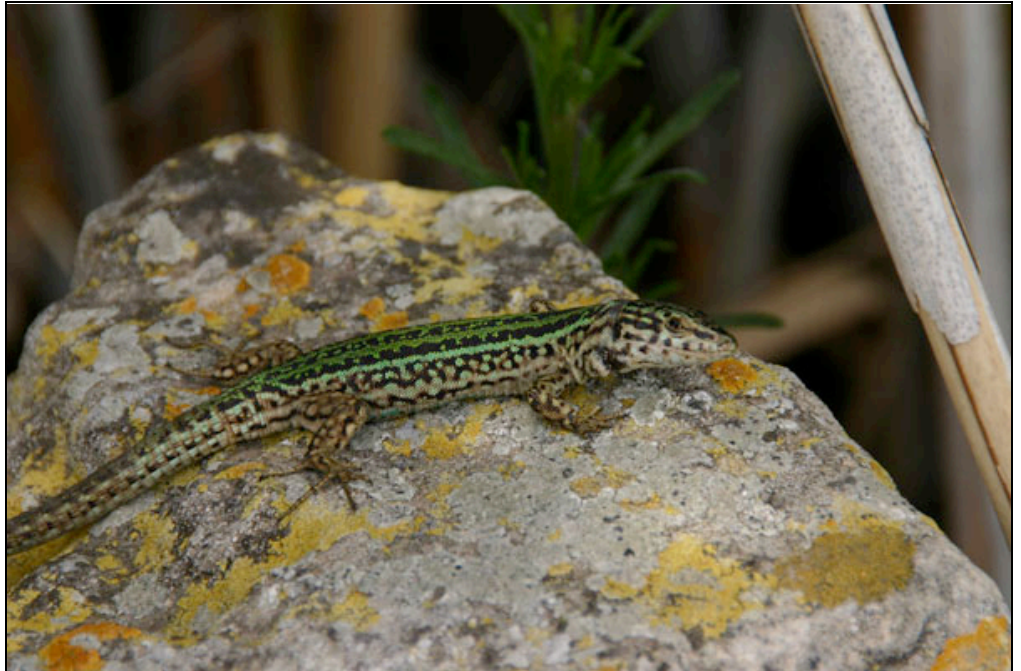
The Ibiza sub-species of Ibiza Wall lizard ( Podarcis pityusensis pityusensis )