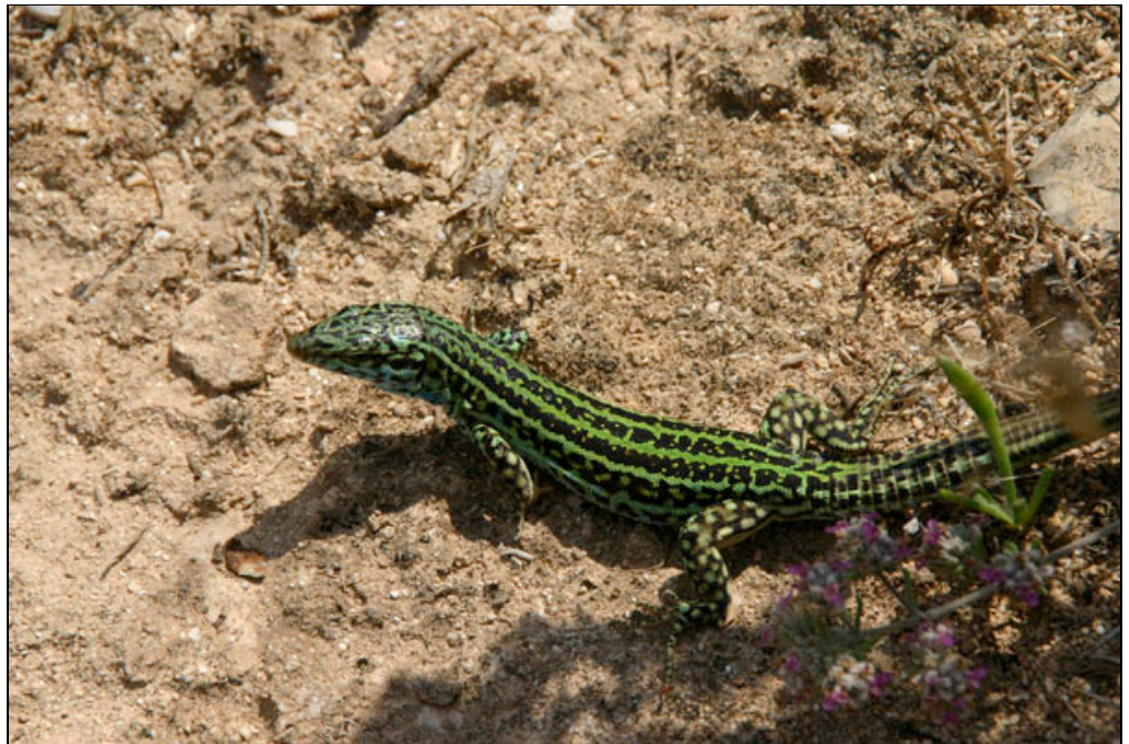
The Formentera sub-species of Ibiza Wall lizard ( Podarcis pityusensis formenterae )