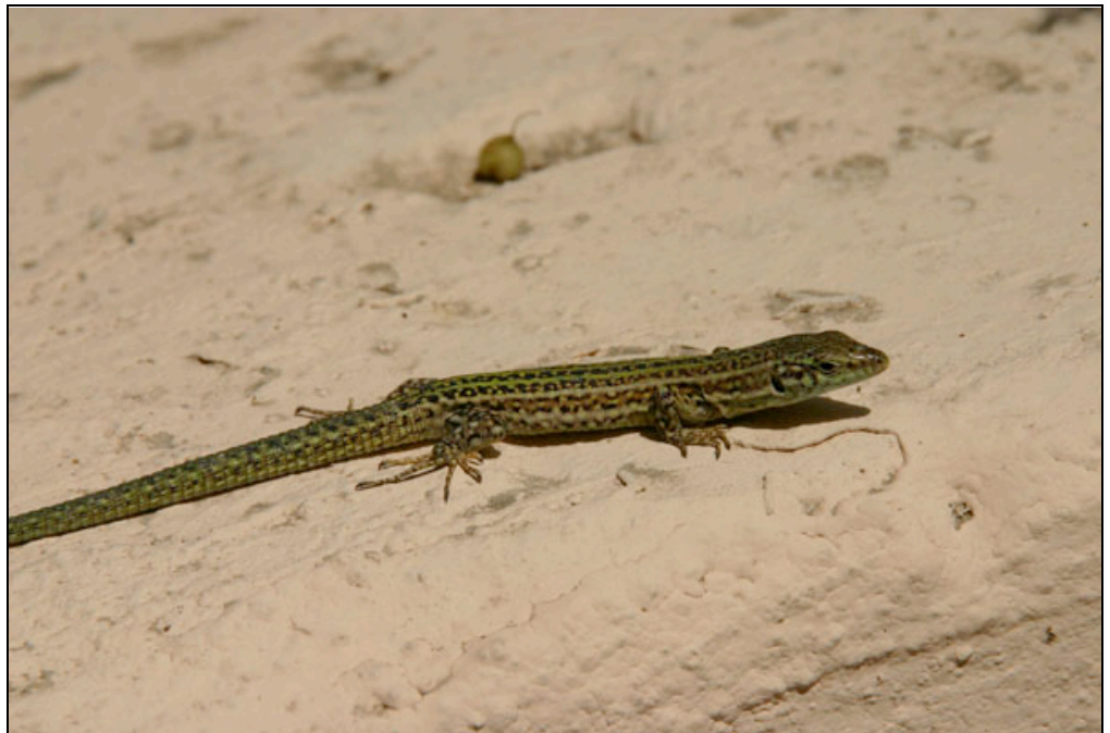
The Ibiza sub-species of Ibiza Wall lizard ( Podarcis pityusensis pityusensis )