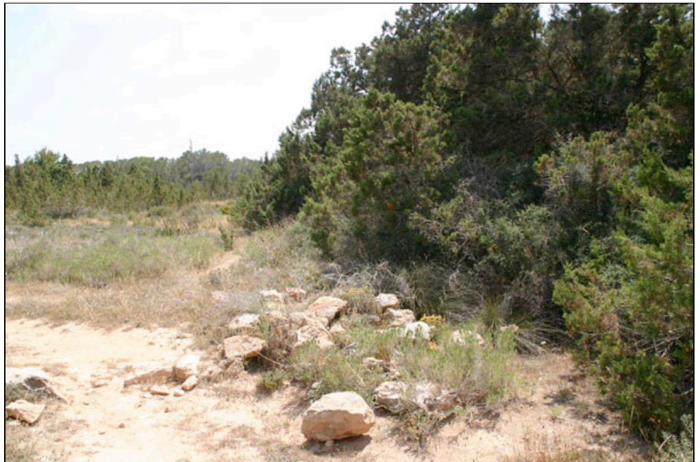
Habitat of the Ibiza Wall lizard ( Podarcis pityusensis formenterae )