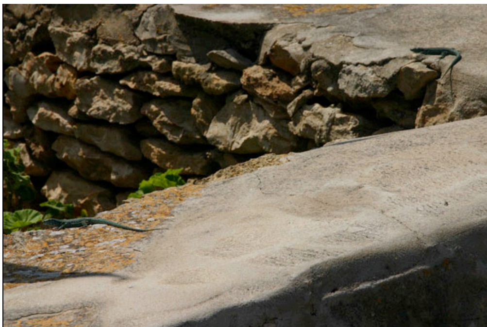
The Formentera sub-species of Ibiza Wall lizard ( Podarcis pityusensis formenterae )