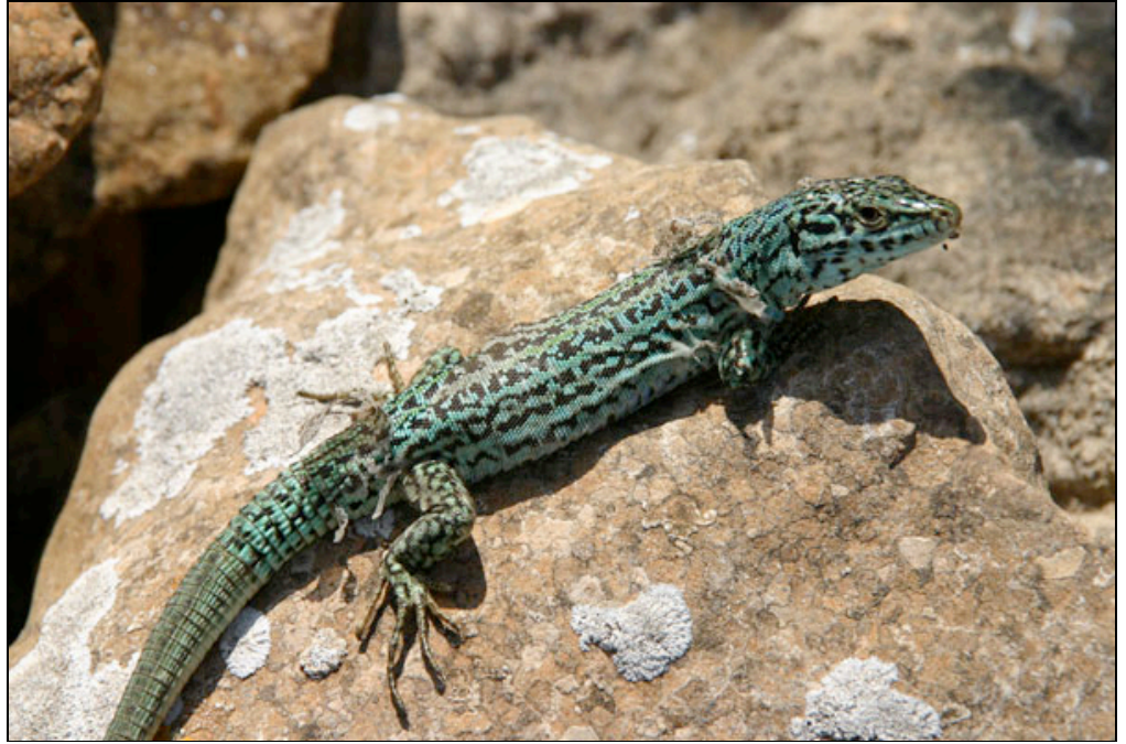
The Formentera sub-species of Ibiza Wall lizard ( Podarcis pityusensis formenterae )