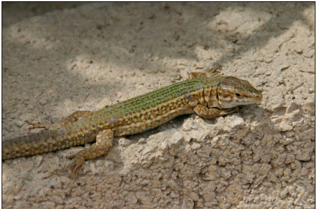
The Ibiza sub-species of Ibiza Wall lizard ( Podarcis pityusensis pityusensis )