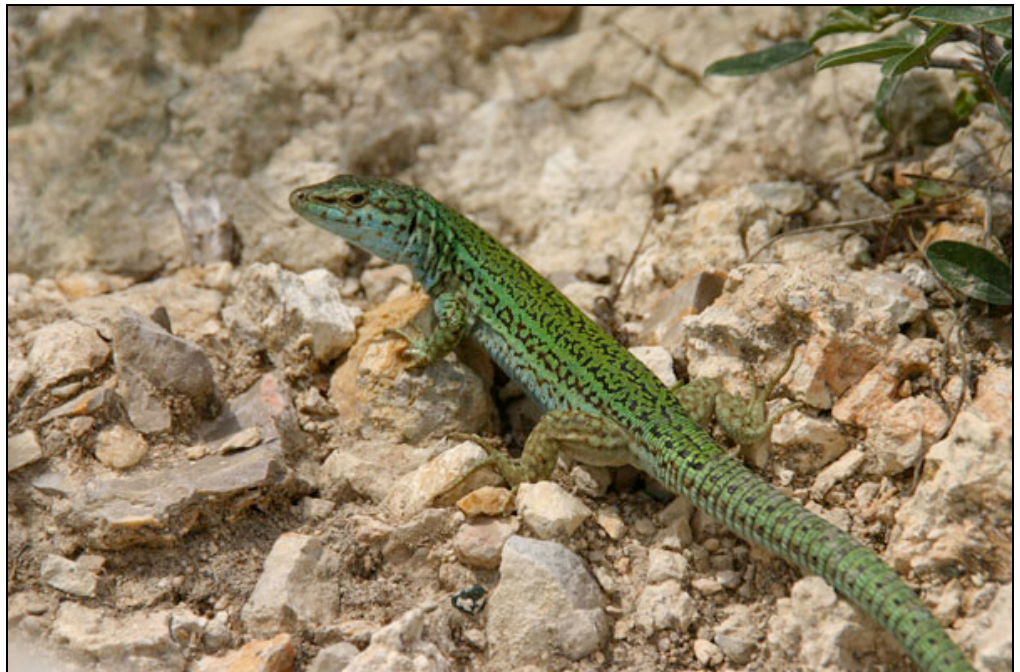
The Ibiza sub-species of Ibiza Wall lizard ( Podarcis pityusensis pityusensis )