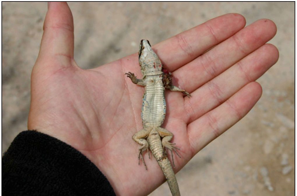
A dead Ibiza Wall lizard ( Podarcis pityusensis pityusensis )