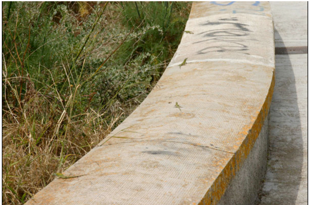
The Ibiza sub-species of Ibiza Wall lizard ( Podarcis pityusensis pityusensis )