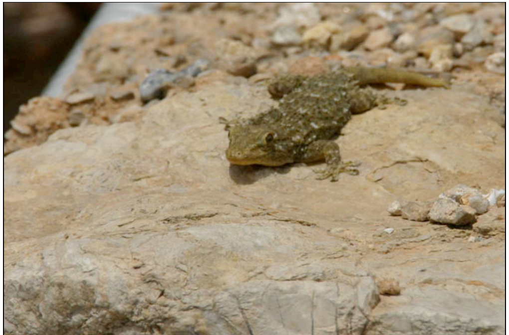
Moorish Gecko ( Tarentola mauritanica )