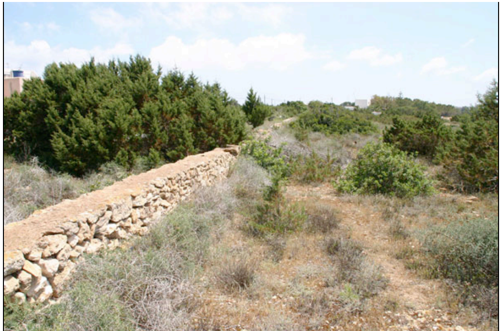
Habitat of the Ibiza Wall lizard ( Podarcis pityusensis formenterae )