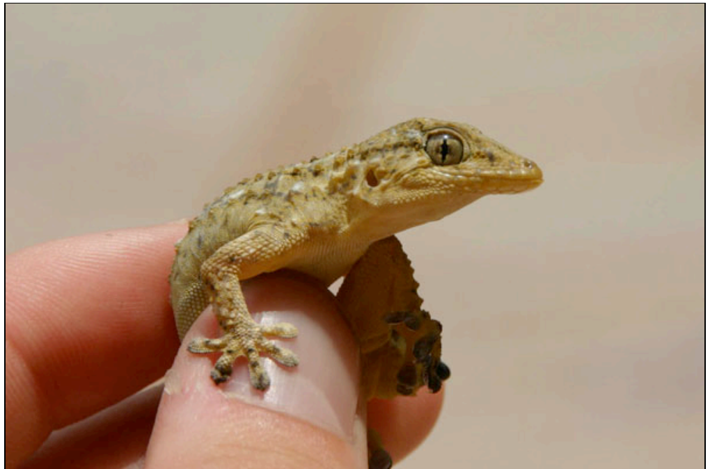
Moorish Gecko ( Tarentola mauritanica )