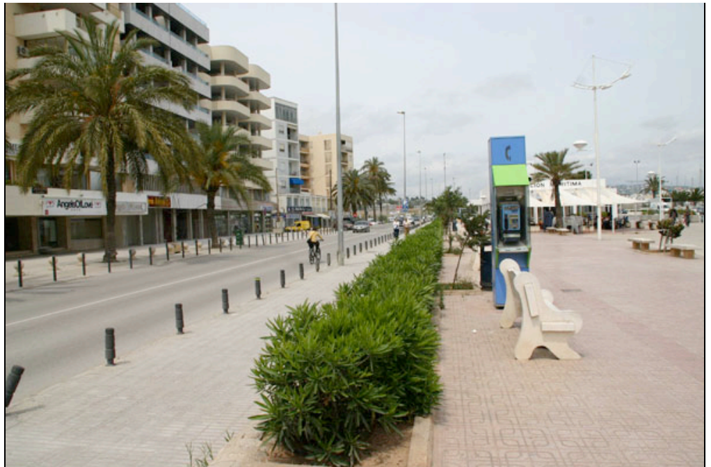
The Ibiza sub-species of Ibiza Wall lizard ( Podarcis pityusensis pityusensis )