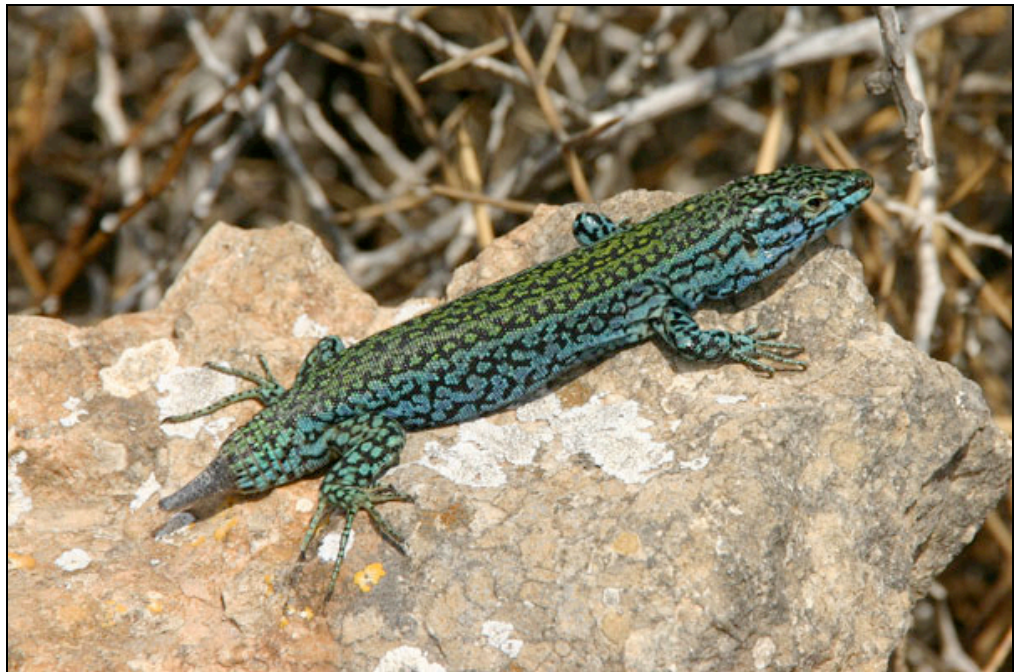
The Formentera sub-species of Ibiza Wall lizard ( Podarcis pityusensis formenterae )