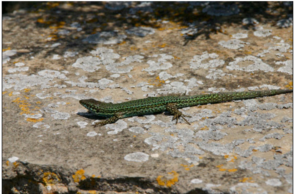
The Formentera sub-species of Ibiza Wall lizard ( Podarcis pityusensis formenterae )