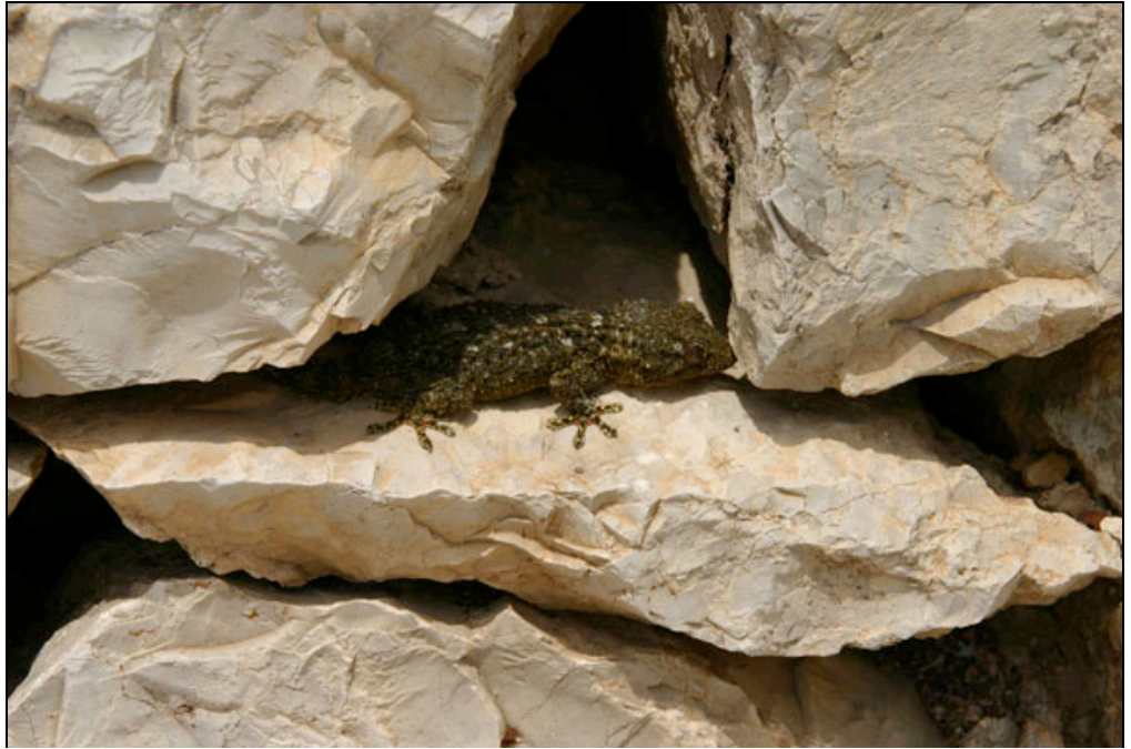
Dark specimen of Moorish Gecko ( Tarentola mauritanica )