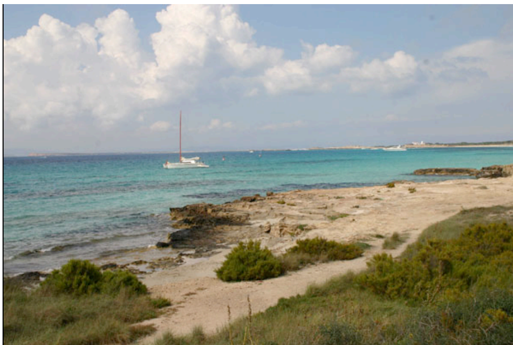
View of the sea