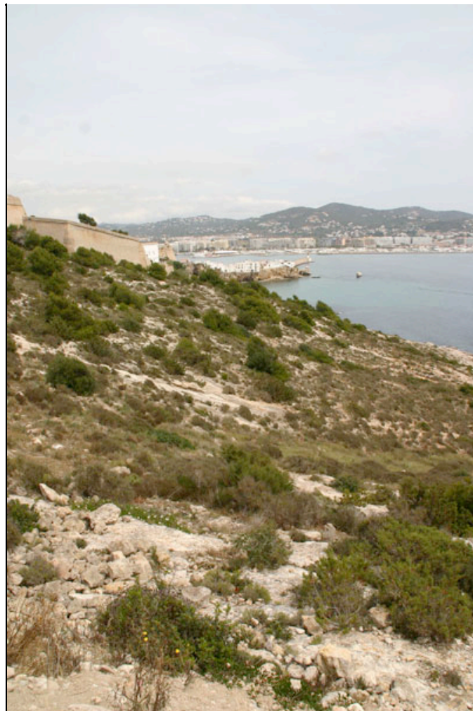
Habitat of the Ibiza Wall lizard ( Podarcis pityusensis pityusensis )