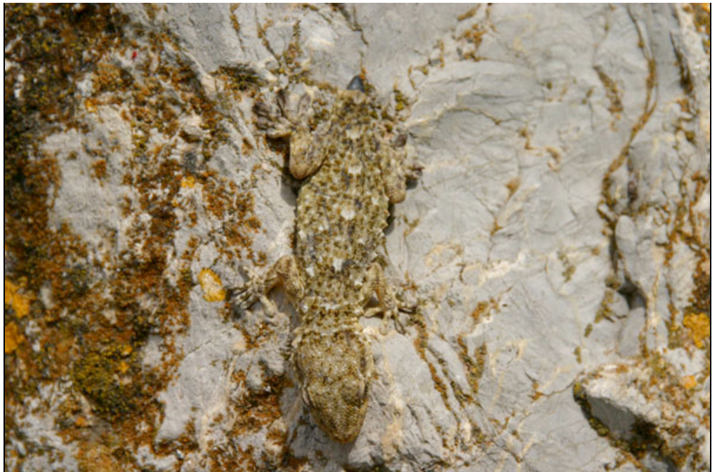
Habitat for Moorish Gecko ( Tarentola mauritanica ) and Ibiza Wall lizard ( Podarcis pityusensis pityusensis )