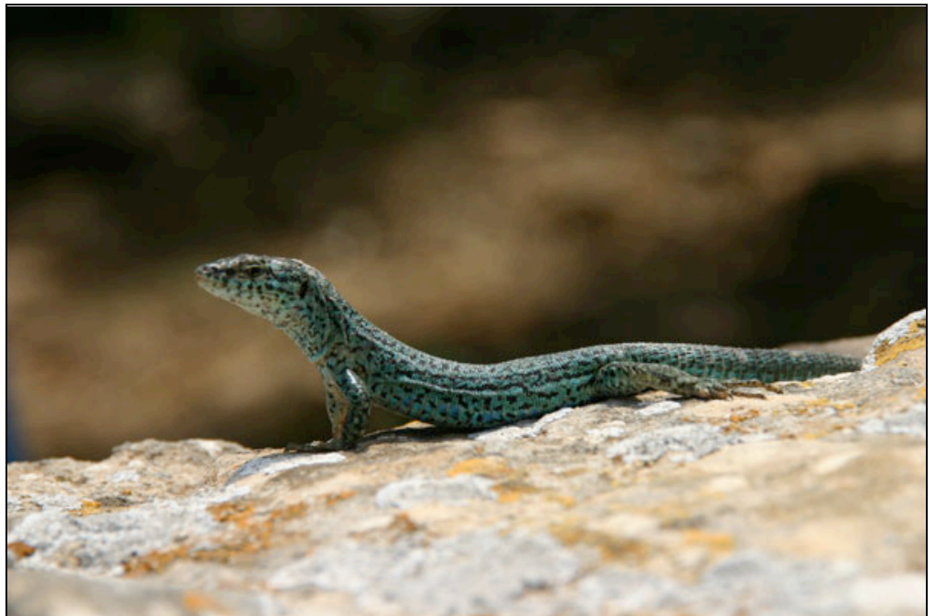
The Formentera sub-species of Ibiza Wall lizard ( Podarcis pityusensis formenterae )