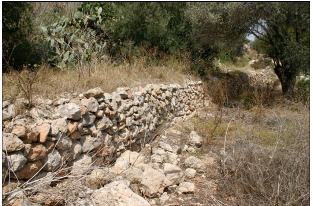
Habitat of the Ibiza Wall lizard ( Podarcis pityusensis pityusensis )