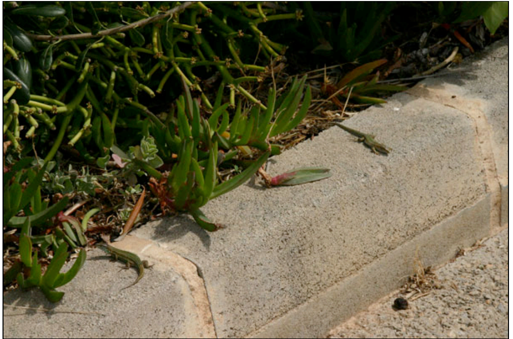
The Ibiza sub-species of Ibiza Wall lizard ( Podarcis pityusensis pityusensis )

We know the most beautiful places and you'll have unforgettable days www.100proibiza.com