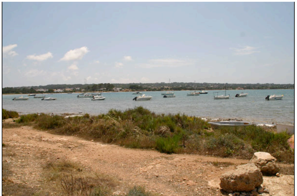
View of the bay