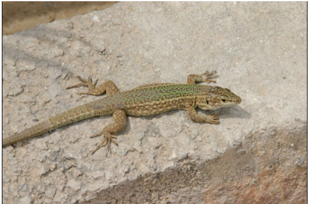
The Ibiza sub-species of Ibiza Wall lizard ( Podarcis pityusensis pityusensis )