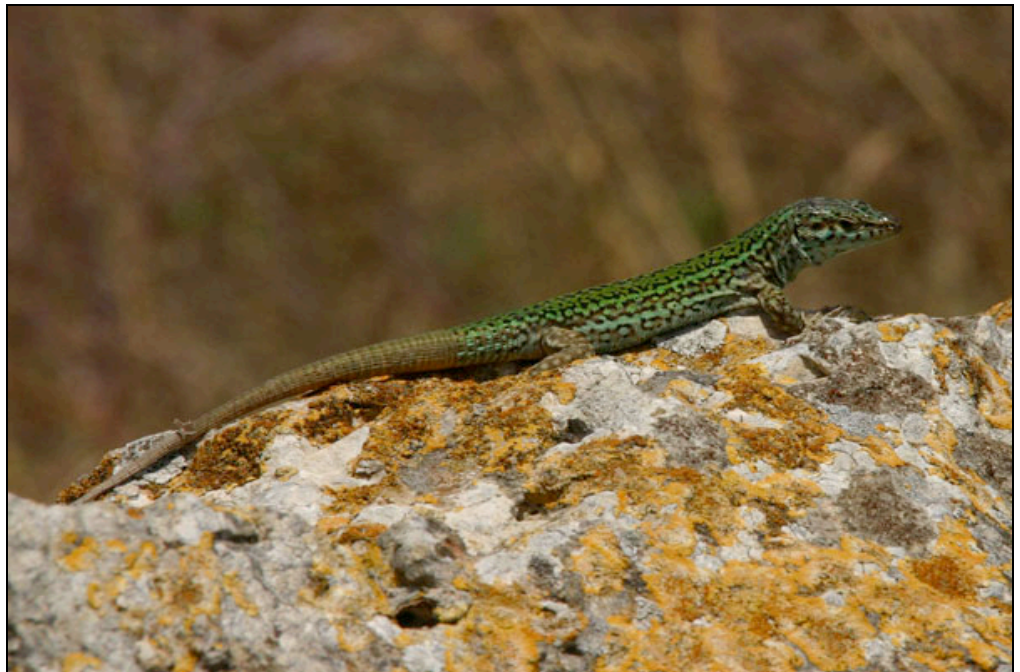
The Ibiza sub-species of Ibiza Wall lizard ( Podarcis pityusensis pityusensis )