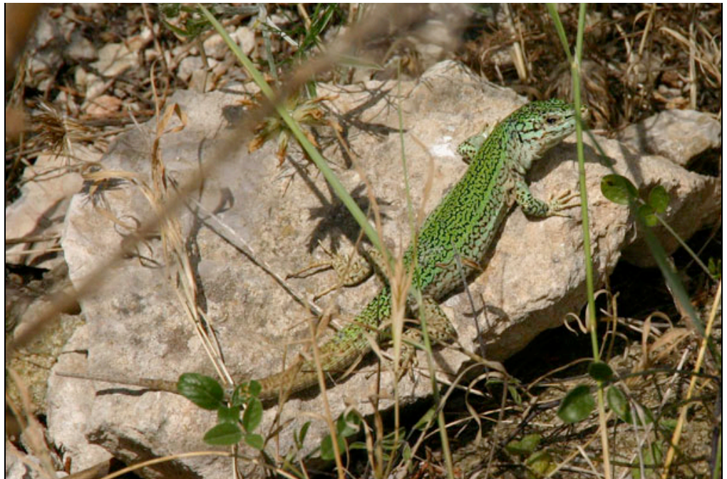
The Ibiza sub-species of Ibiza Wall lizard ( Podarcis pityusensis pityusensis )