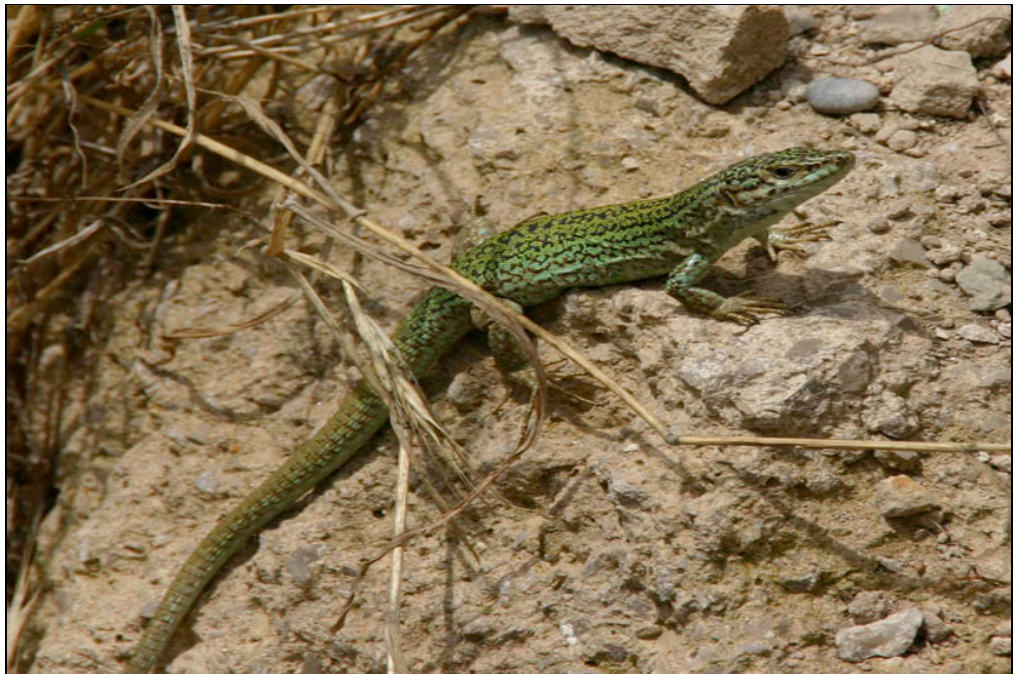
The Ibiza sub-species of Ibiza Wall lizard ( Podarcis pityusensis pityusensis )