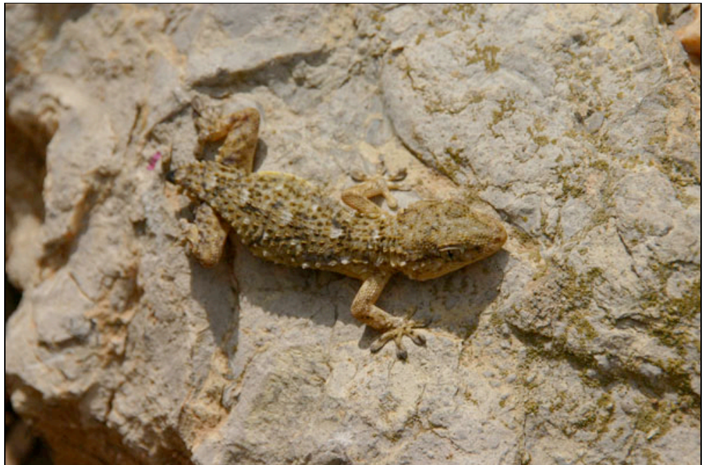
Moorish Gecko ( Tarentola mauritanica )