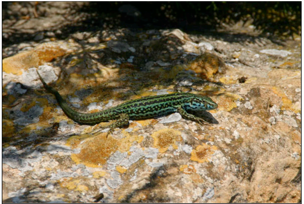
The Formentera sub-species of Ibiza Wall lizard ( Podarcis pityusensis formenterae )