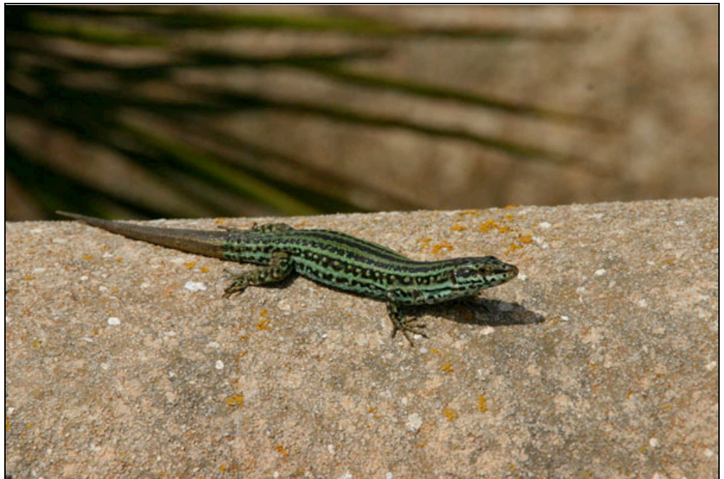
The Formentera sub-species of Ibiza Wall lizard ( Podarcis pityusensis formenterae )