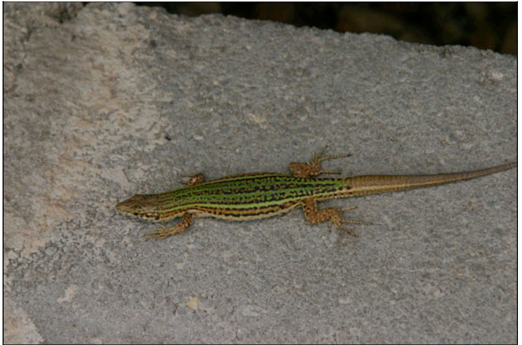
The Ibiza sub-species of Ibiza Wall lizard ( Podarcis pityusensis pityusensis )