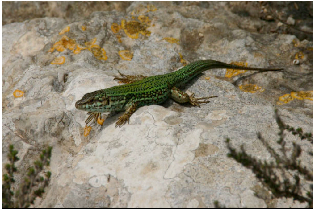
The Ibiza sub-species of Ibiza Wall lizard ( Podarcis pityusensis pityusensis )