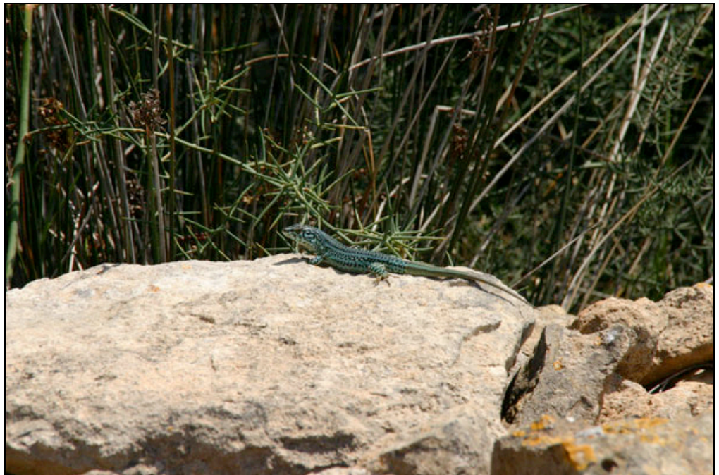
The Formentera sub-species of Ibiza Wall lizard ( Podarcis pityusensis formenterae )