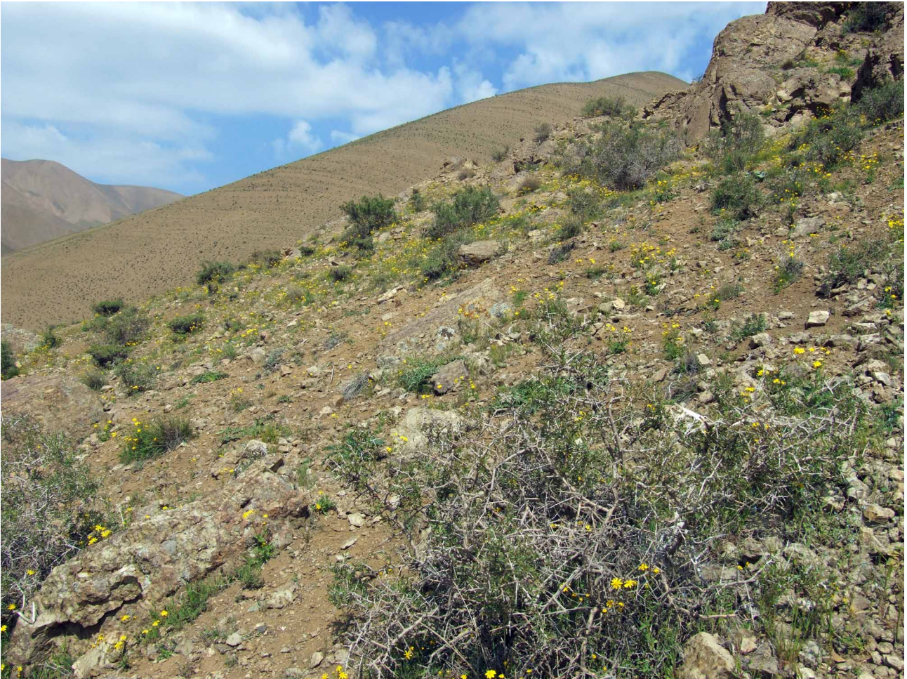
FIGURE 4. Habitat at the type locality of Eremias papenfussi sp. nov.

Remarks. All specimens were collected from the southern slopes of the central Alborz Mountains. The habitat in this part of the Alborz consists of mild rocky slopes. The dominant vegetation is Amygdalus , Astragalus , and annual grass (Fig. 3). Whereas many parts of central Alborz are similar, we expect that Eremias papenfussi is distributed throughout the central Alborz.