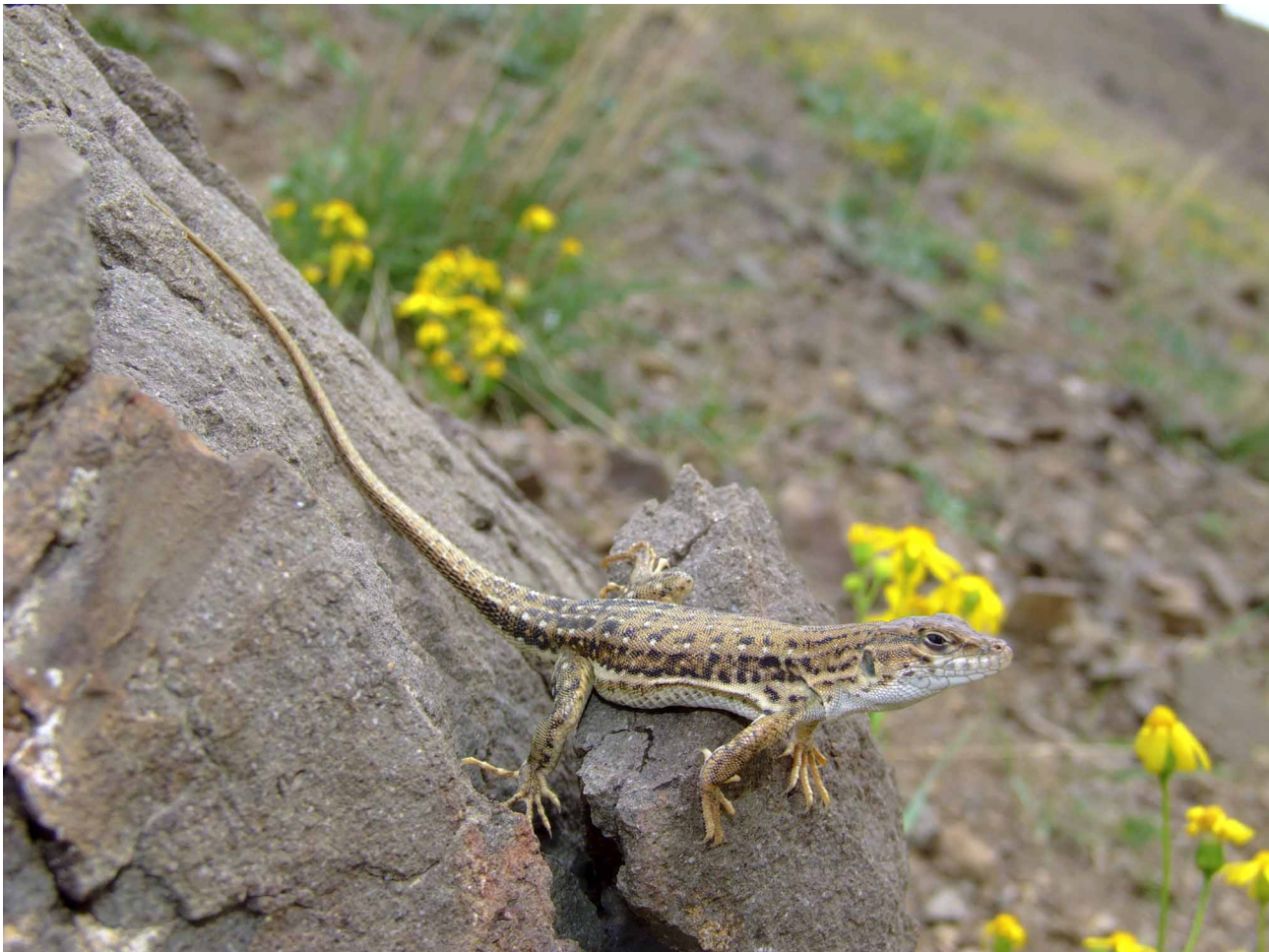
FIGURE 3. Eremias papenfussi sp. nov. in its natural habitat.