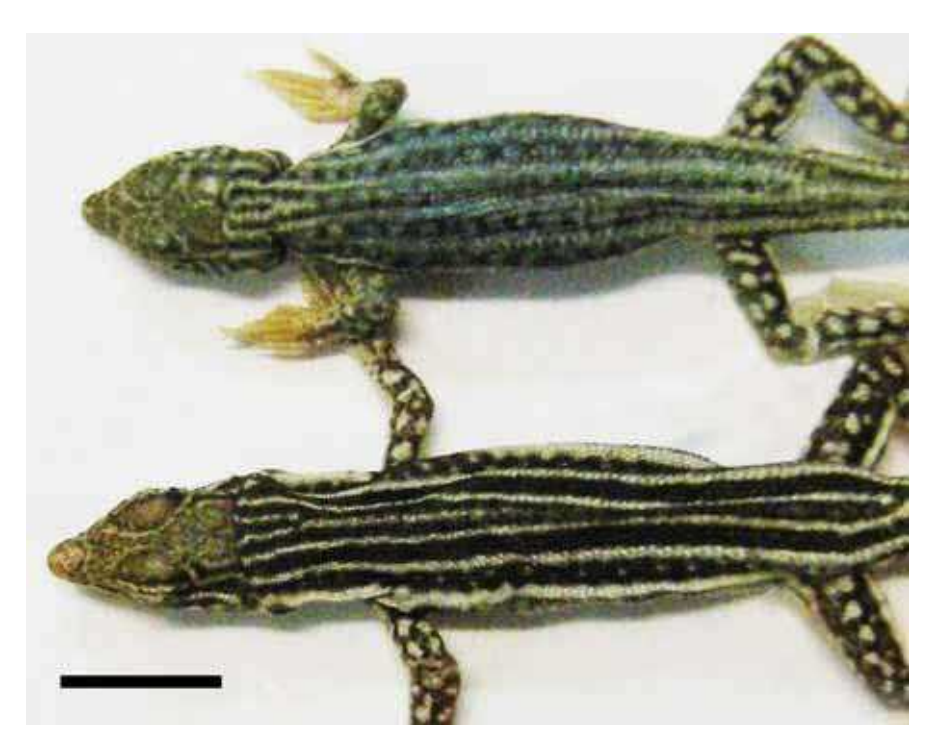
Fig. 4. Acanthodactylus boskianus asper subadults. The dark vertebral stripe forks towards the head and encloses a short central streak from the occiput A [top], The forking occurs very near the head (HUJR 12571, Mishor Rotem, Negev, Israel). B [bottom], The forking starts behind the forelimbs (HUJR 10426, Ma'adan, Syria).

stripes. In adult males the pattern is faded and the vague light vertebral stripe appears to somehow disintegrate and fan out towards the occiput. In female FMNH 167964 the vertebral light stripe is distinct (though less conspicuous than the others) from between the hindlimbs to behind the forelimbs. There it is broken up into a series of speckles and thence it forks towards the occiput as a pair of solid lines.(Fig. 7). In the juvenile MNHN 2762 (holotype) the white vertebral line is not forked.