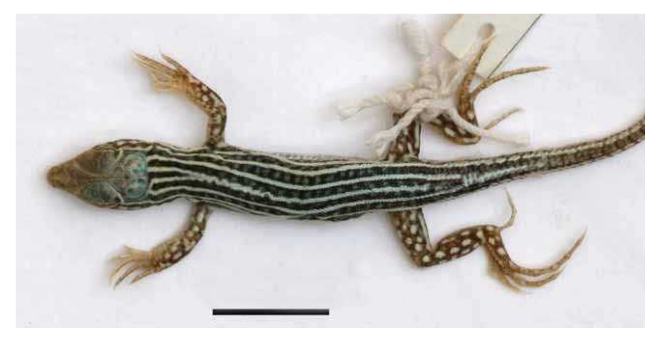
Fig. 6. Acanthodactylus schreiberi syriacus juvenile. The vertebral stripe is white and in this case forks behind the head. (HUJR 13291, Nizzanim, coastal plain, Israel).