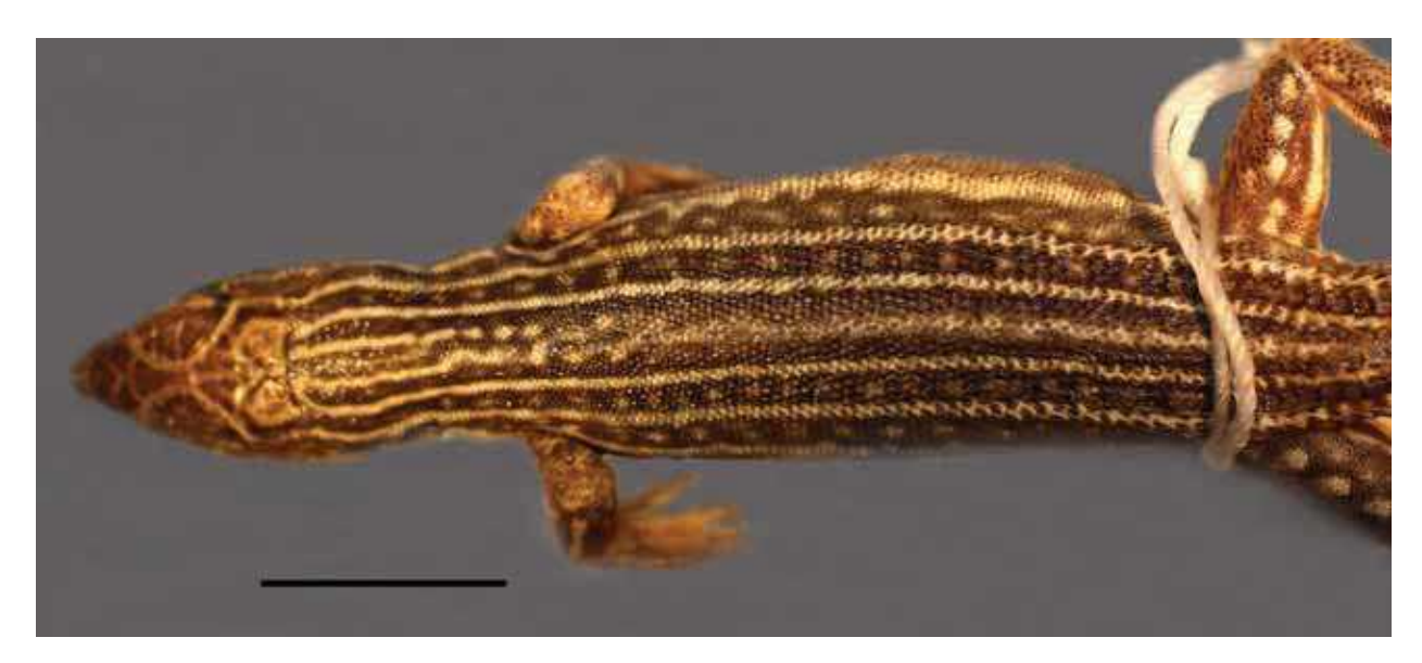
Fig. 7. Acanthodactylus boskianus boskianus adult female. The vertebral stripe is white and in this case forks between the forelimbs (FMNH 167964, Kafr el Sheikh, Egypt).

granted, and speak of conspicuous stripes without specifying whether these are light or dark (e.g., DISI et al. 2001). But actually as the juvenile grows, the dark stripes expand, fade and attain the hue that matches the substratum. From this aspect, they represent the lizard's background color, and the lizard is adorned with whitish stripes. Nevertheless one needs to discuss the black stripes as a dynamic pattern unit, as follows.