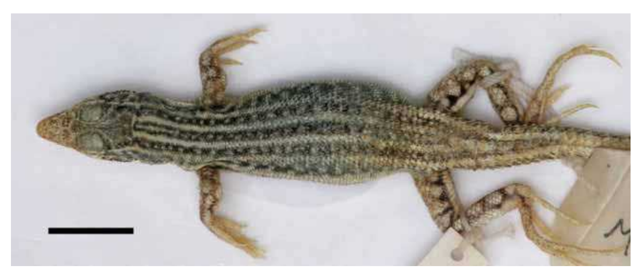
Fig. 3. Acanthodactylus opheodurus . The dark vertebral stripe extends simple (unforked) from hindlimbs to occiput. (HUJR 2661, gravid female, southern ha-'Arava Valley, Israel).