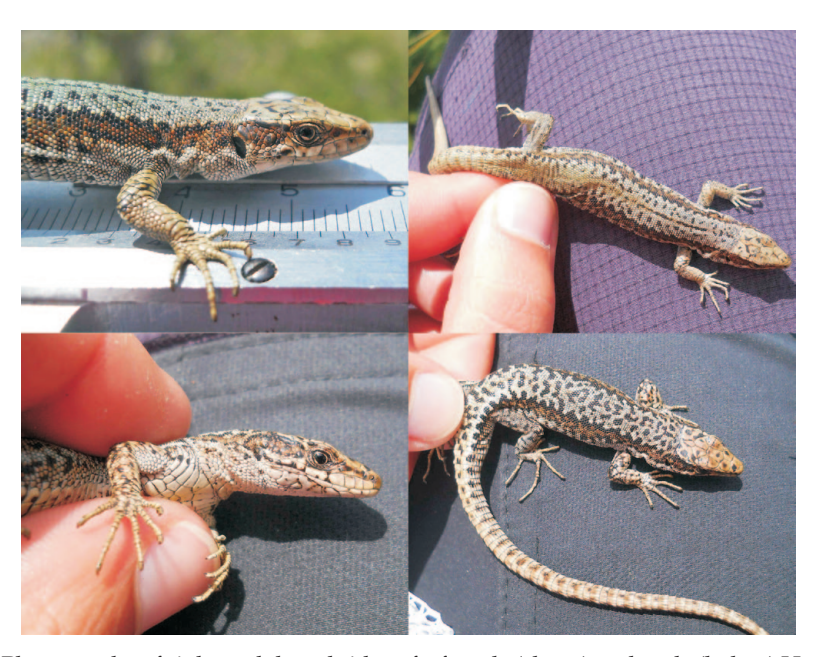
Fig. 2. Photographs of right and dorsal sides of a female (above) and male (below) Horvath's rock lizard ( Iberolacerta horvathi ) found on Dinara Mountain (Croatia).