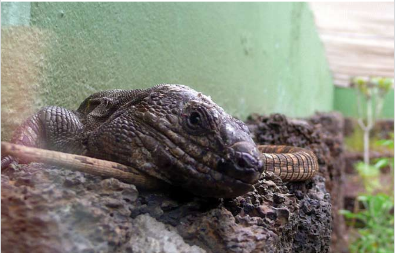
The el Hierro giant lizard (Gallotia simonyi) in the captive breeding centre

This project sought to gain knowledge and to develop a management plan for the recovery of the species. It also introduced a captive breeding programme. The second project, "Reintroduction of El Hierro giant Lizard in its former natural habitat" (LIFE97 NAT/E/00419) was implemented directly by the regional government. It aimed to re-establish a viable population of the giant lizards in the wild through the release of animals bred in captivity.